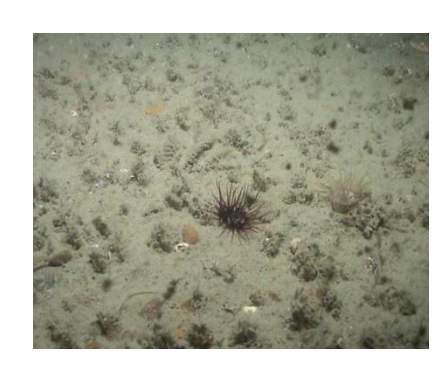
Lanice bed at Shakespeare Ridge Inshore, 2014