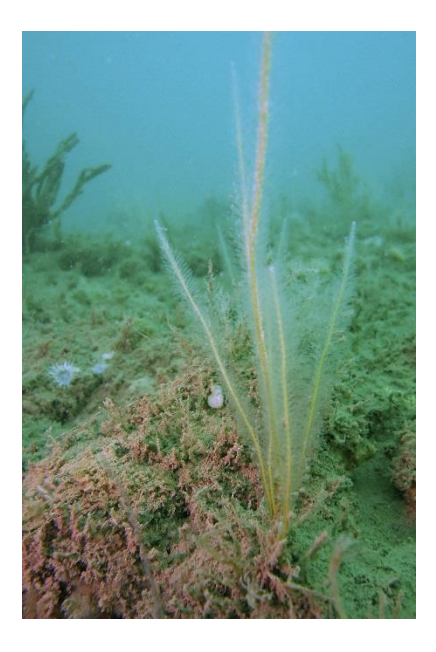
Nemertesia antennina hydroid, and other animal turf, Horsehead Outcrops, 8 June 2014