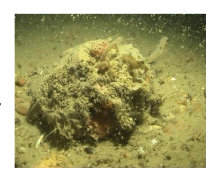
Animal turfcovered boulder at Shakespeare Ridge Inshore, 2014