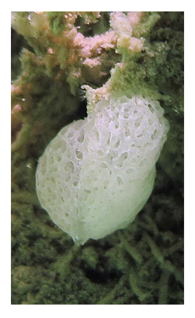
Clathrina coriacea, a sponge not previously recorded in Kent. Horsehead Outcrops, 8 June 2014