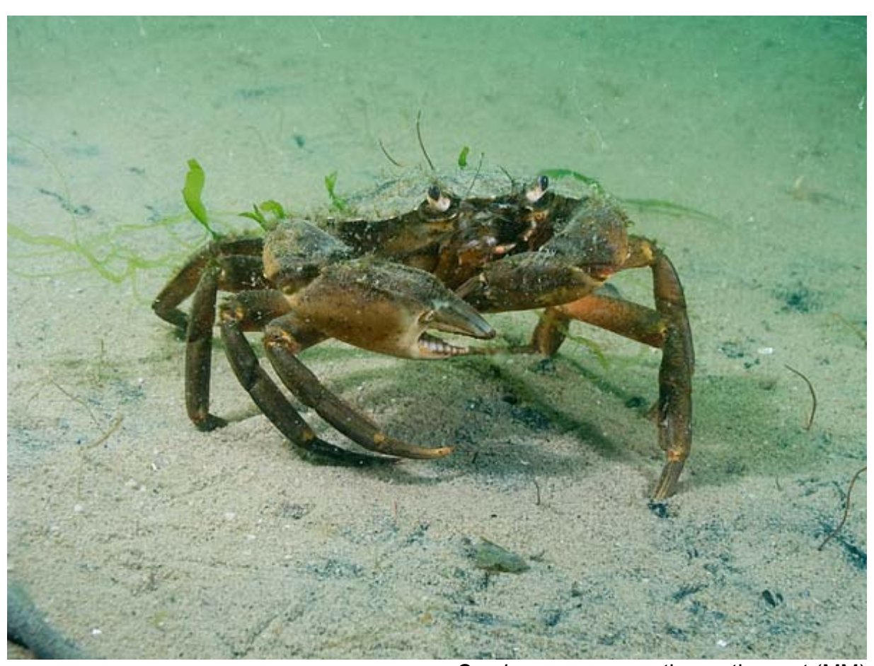
Carcinus maenus on the north coast