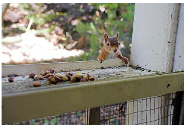
One of the friendly visitors to the kitchen window at the DWT villa (MD).