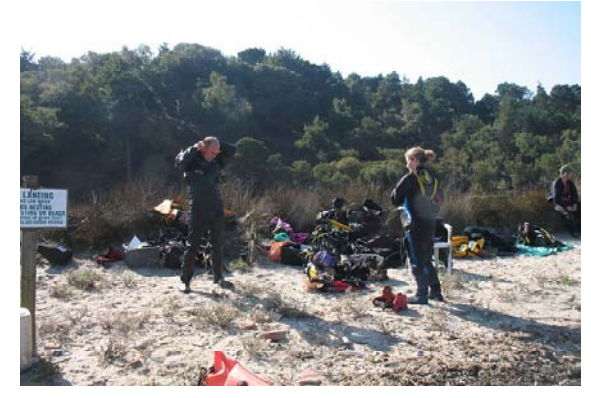
Divers kitting up on the north shore of Brownsea (MD).

Species of interest on the dives were the nationally rare sponge Suberites massa and three nationally rare red algae Chondria coerulescens, Gracilaria bursa pastoris and Gracilaria multipartite . No seahorses were observed. The full data set is provided in Appendix B with SACFOR abundance ratings, as explained in Appendix E.