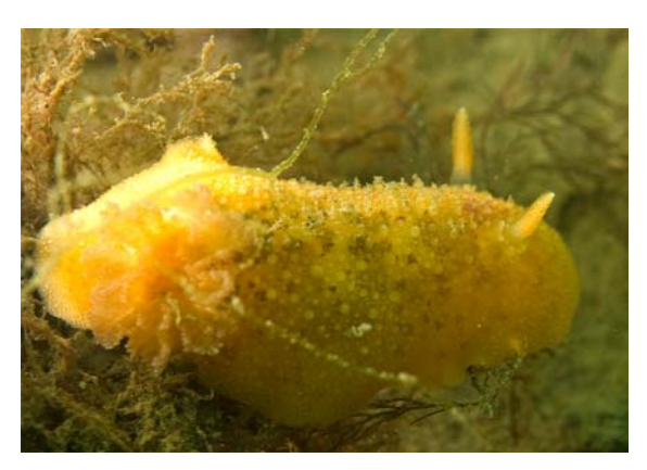
Archidoris pseudoargus seen near the old chain ferry (NO).