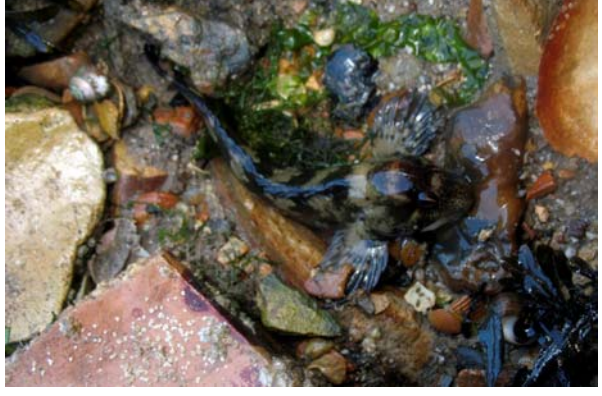
Ammothea hilgendorfi found on the shore.