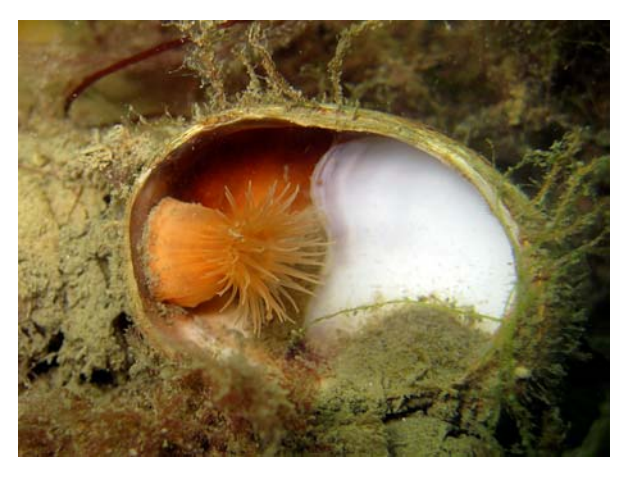
Diadumene cincta living within a Crepidula fornicata shell (LB).