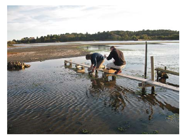
Collecting core samples from the edge of the lagoon (PW).

The main lagoon at the eastern end of Brownsea Island is extremely shallow with soft mud. It is not possible to snorkel or walk safely across the lagoon; such activities may also be detrimental to the lagoon. Most of the animals in the lagoon live on and in the mud (benthic organisms). On the surface of the mud were thousands of starlet anemones, Nematostella vectensis . These have UK Biodiversity Action Plan status, are regarded as Nationally Scarce and are included on the IUCN Red Data List of threatened species as Vulnerable. Despite their national scarcity, we estimated their density at each location in the lagoon to be in the order of 1000 to 1500 individuals per square metre. If the anemone cover is uniform throughout the lagoon, then Brownsea Island is home to tens of millions of these tiny animals.