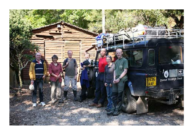
The survey team (MD).