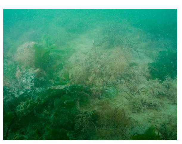
Typical view of the seabed near to the old chain ferry on the north coast (MM).