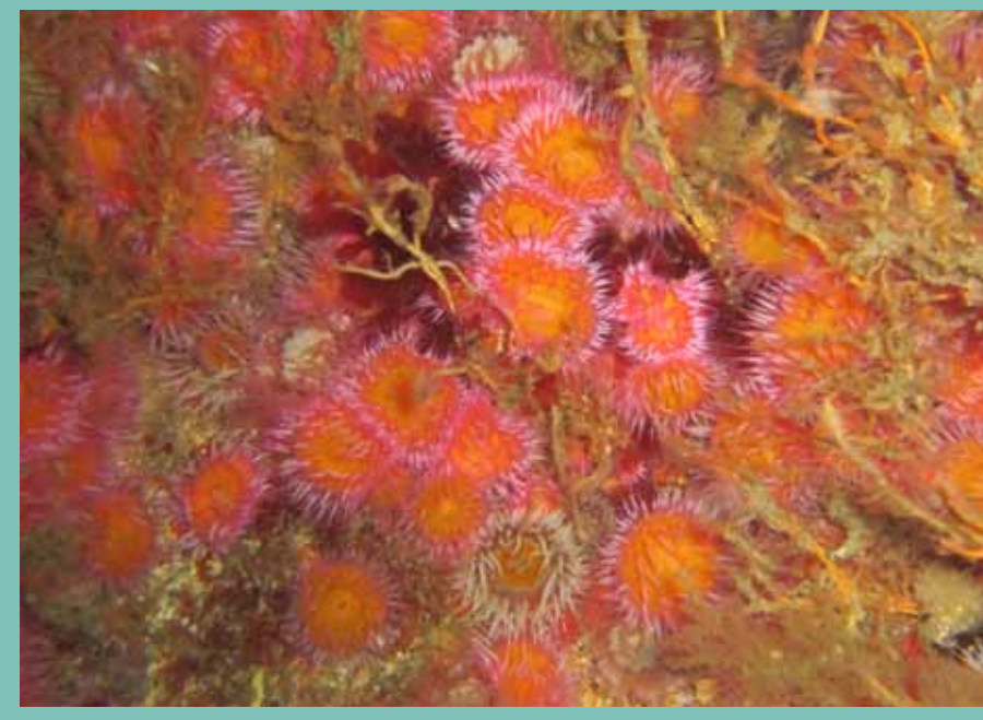
Elegant anemones.

After five cancelled attempts in 2012-13, we finally made it to the Runnel Stone this year – not just once, but twice! It was definitely worth waiting for thanks to the prolific marine life; elegant and jewel anemones in every colour imaginable, a profusion of oaten pipe hydroids and nudibranches; all seen in over 12m visibility! We dived a total of 7 sites within the pMCZ, gathering valuable data to support its designation.