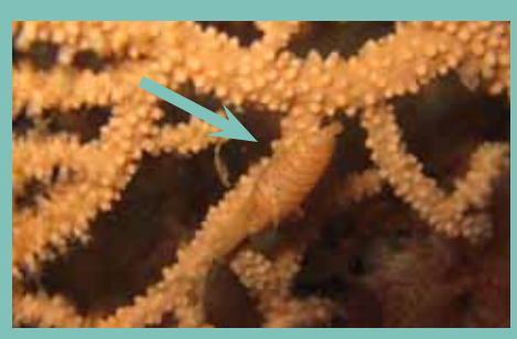
Sea fan nudibranch, anemone, and false cowrie.