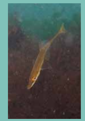
Fifteen-spined stickleback.

Seasearch divers joined a team from PADI AWARE's Dive Against Debris programme, Kernow Divers, and The National Trust to perform an underwater litter pick at Lansallos cove. The picturesque cove has a beautiful reef on one side but along the western side a large amount of man-made debris has built up, most of it are washed ashore by currents and tide. Over 1600 pieces of debris were removed from the water and catalogued by volunteers. A Seasearch survey was also performed, as this was a rare chance to survey the cove which is usually inaccessible to shore divers.