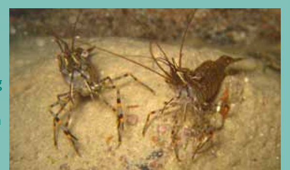
rawns seen in Newquay pMCZ.

all summer, divers achieved their goal when colonies of this important species were eventually found! These records will add strength to the growing evidence base that will support the campaign for the protection of this site. Thanks are due to Dive Newquay for generously donating boat dives to support these surveys.