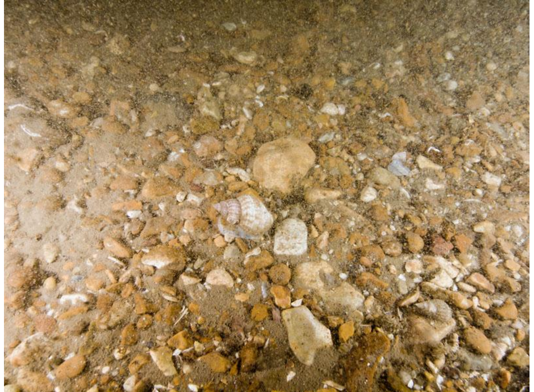
Photo Selection (see submitted photo evidence spreadsheet file files for more)

South Utopia. 13<sup>th</sup> April 2014. Mike Markey. SS.SMx.CMx (Eunis A5.44) BSH: Subtidal mixed sediment Photo file name: 140413_SUtopia_MikeMarkey_1404130003c MR Event Key: MRLRC012000001C6