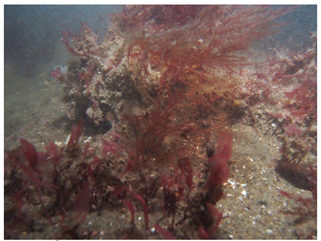
Photo Selection (see submitted photo evidence spreadsheet file files for more)

Bembridge. 13<sup>th</sup> April 2014. James Lucey. IR.MIR.KR.XFoR (Eunis A3.215)