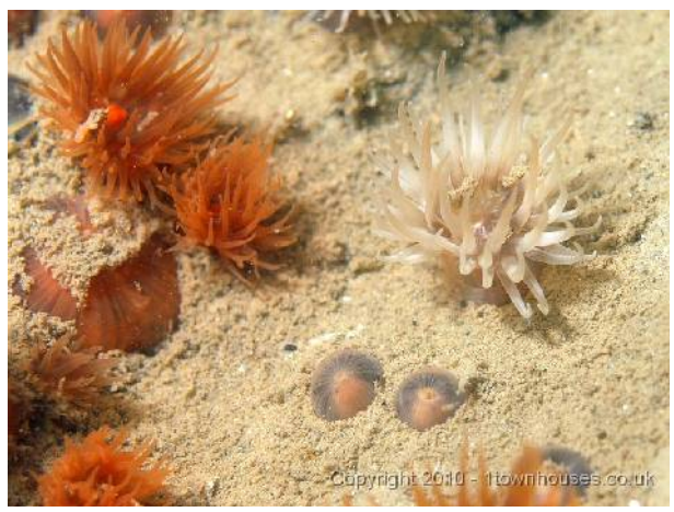
Diadumene cincta anemones

A revisit to the only site we dived off Lowestoft in 2009. Conditions were 'adverse' to say the least . At the bottom of the wreck visibility was limited to dim torch glows through the sediment. Ascending we emerged from the cloud and it was apparent that the wreck was coated by a super abundance of the small crustaceans Caprella spp and Jassa falcata. This coating was occasionally broken by the Orange Wreck anemone (Diadumene cincta) the only animal of any size which was common on the wreck.