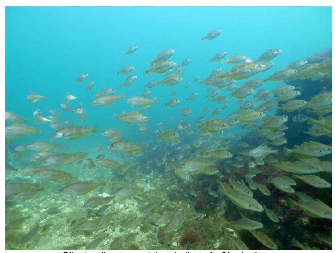
Bib shoaling around the chalk reef - Sheringham