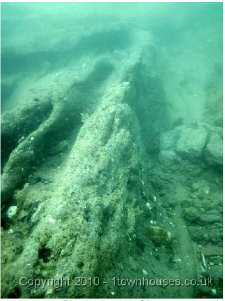
Clay ridges - Cley

Divers didn't observe any major changes in the wildlife population here but large isopods and a Sea Snail ( Liparis spp. ) were observed during an exploration of the surrounding gravel plain.