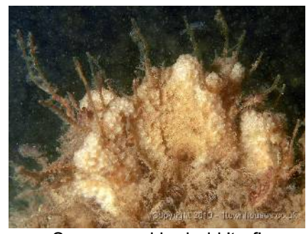
Sponge and hydroid 'turf'