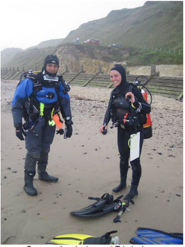
Seasearch volunteers at Trimingham

Pontoon based: 51° 59.737N 01° 16.103E Rather less diverse than Lowestoft Marina, Levington is around 6km from the open sea and looked a lot more polluted. We did manage to record 18 species. 7 of which were ascidians (sea squirts).