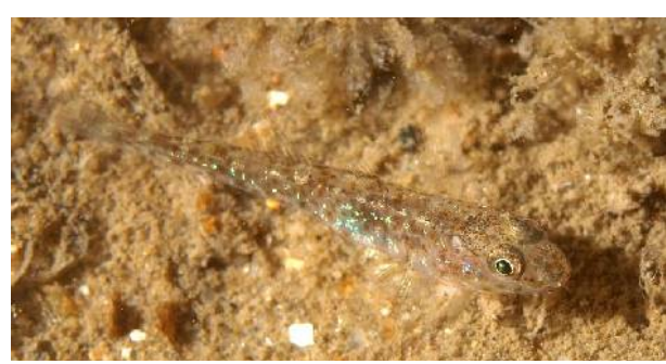
Sand goby - Clansman

The wreckage was densely coated in sponges, cnidarians and bryozoans with three species of nudibranchs recorded.