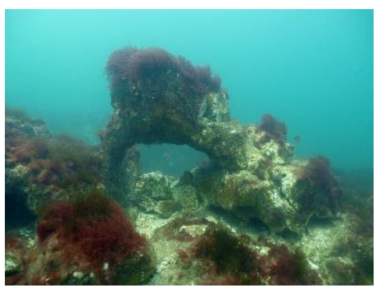
Chalk arch - Sheringham

With the support of Norfolk's council biodiversity departments - Norfolk Biodiversity Information Service (NBIS) and Norfolk Biodiversity Partnership (NBP) - we have made a start on a thorough