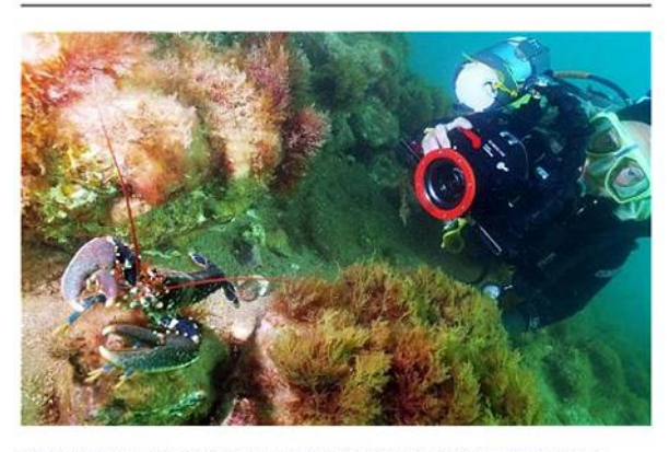
The 20-mile reef, which lies just half a mile from the shore and 30ft below the surface, is

Telegraph View: the marvels of marine life are closer than we think