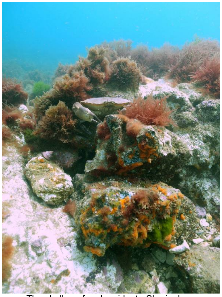
The chalk reef and resident - Sheringham

We have high hopes that the North Norfolk chalk and the Sea Palling mussel bed will be designated as MCZs. There is the prospect of further areas of greater protection too; this process will be rather last minute as the final recommendations will be submitted in Summer 2011 and passed to government in the Autumn. We hope to identify and offer candidate areas of clay, chalk, mussels and both the Vera and Rosalie as specific sites for protection.