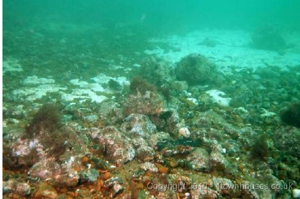
Chalk plain - Cromer

Even though this dive had a minimum depth of 10m, feathery green algae was seen frequently amongst the usual red. The chalk bedrock plain was scoured clean in some places and covered by boulders, cobbles and gravel in others. Dahlia anemones were unusually frequent and there was a good range of sponges. These drifts passed around 500m North of Cromer Pier.