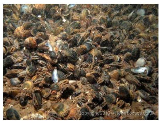
Blue Mussel bed - Sea Palling