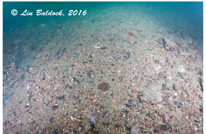
Bat's Head Drift Mega-ripple of shell and dead maerl gravel over bedrock with scattered fragments of live maerl.