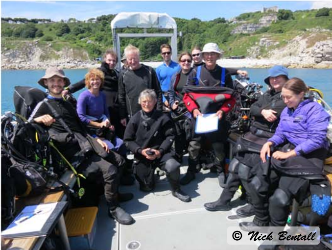
The Saturday Team off Church Ope Cove

A glorious calm, sunny day, you could almost say too hot to be out on deck! The first dive was a drift at about 1knot (too fast for note taking) along a reef under Bat's Head west of Durdle Door in about 18m. The second dive was on the outer edge of The Ledge off the east side of Portland Bill. We had a well timed slack water for this dive and a dignified run over to the site with time for team to pose with Church Ope Cove in the background