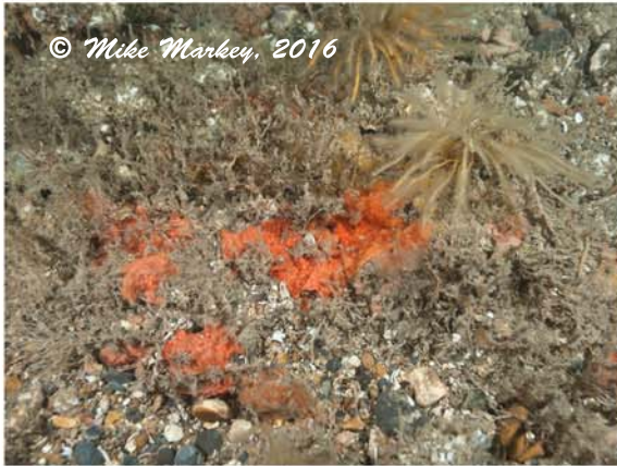
The Ledge Anetenna hydroid, red encrusting bryozoan and old Tubularia covered in "brown fuzz" which Ross pointed out was densely packed amphipod tubes, possibly Jassa .