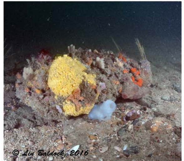
Colourful faunal turf on boulders, Bat's Head Drift