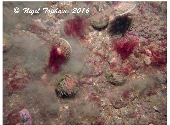
Bat's Head Drift - Queen scallops spoiling the vis'!