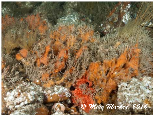
The Ledge Carrot sponge, Amphilectus fucorum, red bryozoan crust Cellaria bryozoan and Anetnna hydroid ( Nemertesia antennina) on cobbles with baranclcs