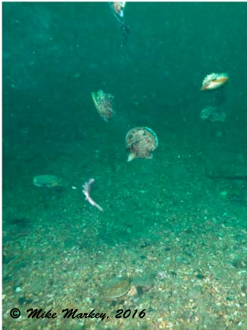
Bat's Head Drift - flying Queen Scallop ( Aequipecten opercularis)