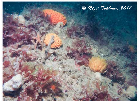
Branching and cushion sponges - Bat's Head Drift