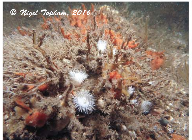
The Ledge Old Tubularia stalks, Cellaria bryozoan, Carrot sponge and striped anemone ( Actinothoes sphyrodeta )