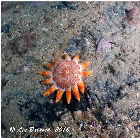
Bat's Head Drift Sunstar, Crossaster papposus , and unusual sighting east of Start Point in Devon.

Here is a link to Tim Watson's short video from the drift dive Swimming Queen Scallops: https://www.youtube.com/watch?v=F5M5ZWNy50Y