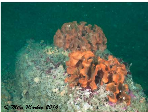
Large Ross Coral colonies, Bat's Head Drift