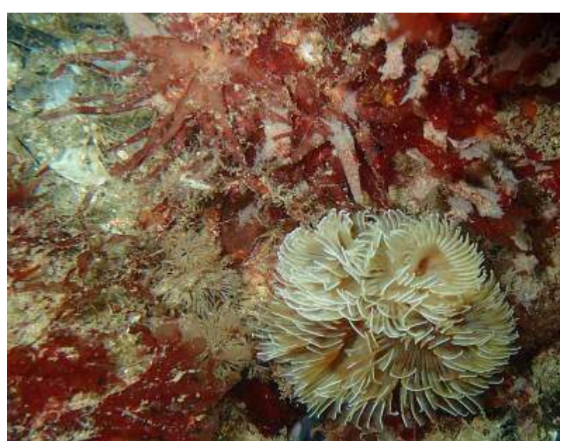
Mixed red algae inc. forked Rhodymenia ardissonei and polychaete fan worm Bispira volutacornis