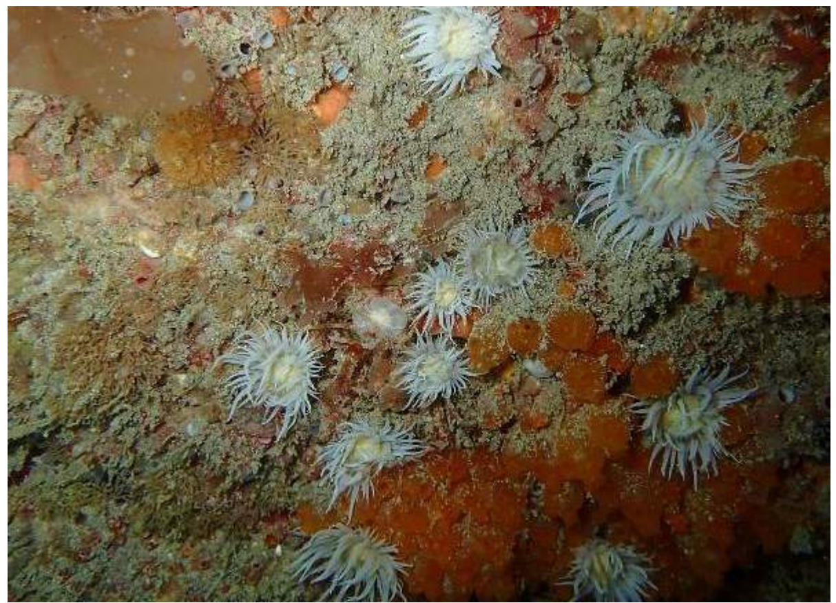
Circalittoral rock at the Cribbar reef, with Actinothoe sphyrodeta, Bugula sp. bryozoans, Polycarpa scuba and Dendrodea grossularia & very cryptic Macopodia crab