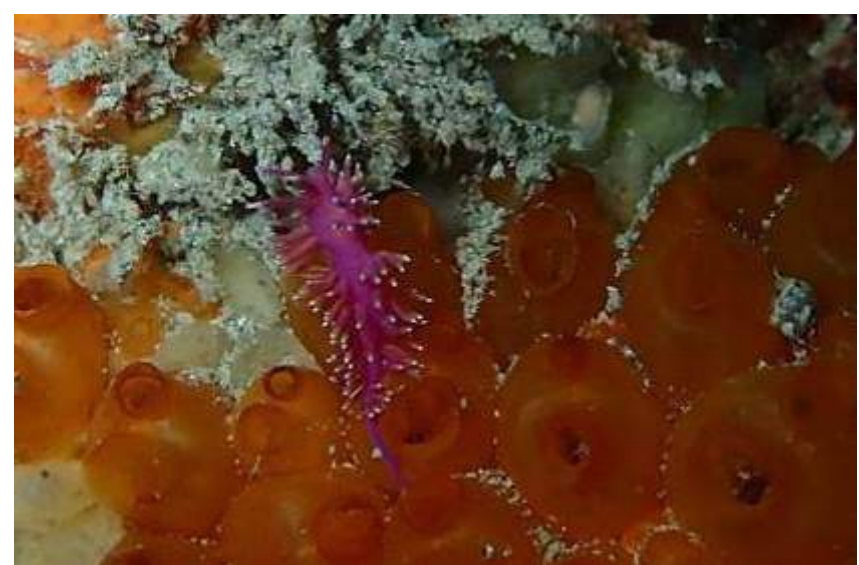
Flabellina pedata nudibranch on mixed faunal turf Circalittoral rock, the Cribbar

This small rocky island lies between Pentire Headland and The Goose rock, and was snorkelled by a number of Observer divers as a trial. The area has a fair amount of current and featured Infralittoral rock with Laminaria digitata , brown algae Desmarestia aculeata , the possible climate change indicator rainbow wrack Cystoseira tamariscifolia , channel wrack Pelvetia canaliculata , painted topshells Calliostoma zizyphinum , dog whelks Nucella lapillus , spiny starfish, Marthasterias glacialis and encrusting red algae, barnacles, edible crabs and spider crabs.