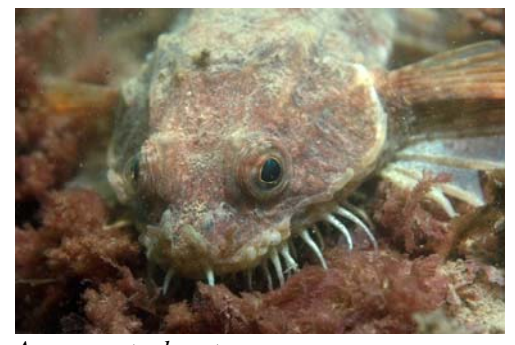
Agonus cataphractus - young pogge

The caves on this section were shallow and interspersed with cliff wall falling to a boulder-