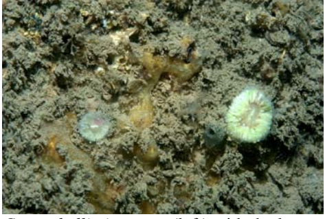
Caryophyllia inornata (left) with the larger C smithii to the right.

This site was again a limestone cliff with sea cave, fissures, cracks and crevices and a rich covering of turf especially near the cave entrance, on overhangs and up to 10m into the cave entrance. Caryophyllia inornata was recorded as common together with the larger Caryophyllia smithii , the Devonshire cup coral, 7 species of sponge, 10 species of mollusc and 12 species of algae. From the cave entrance large boulders led down to smaller boulders, cobbles and sand patches at 6m below sea level. The boulders had little kelp cover at this time of year but many holdfasts indicated a thick summer growth.