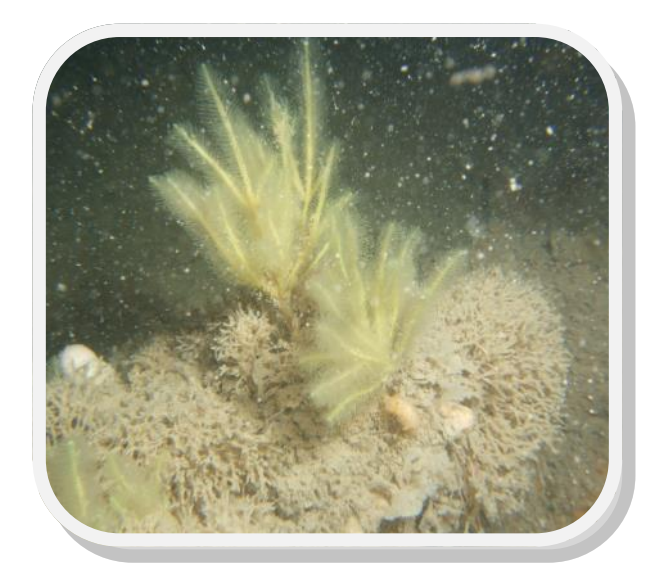
Above: Branched antenna hydroid Nemertesia ramosa and bryozoans cover a boulder at Ross worm shelf

Several species of nudibranch were recorded at this site including Polycera faeroensis and Facelina bostoniensis .