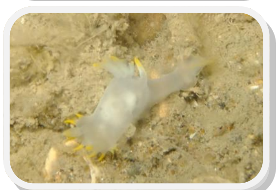
Top: A branching sponge and Sagartia anemone at Wreckless © Fiona White

Above: The nudibranch Polycera faeroensis at Wreckless © Fiona White