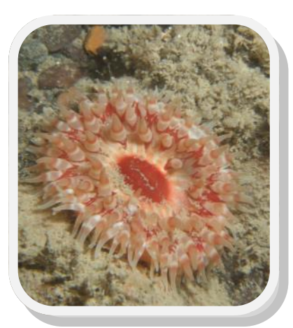
Above: Dahlia anemone Urticina felina at Ross worm shelf