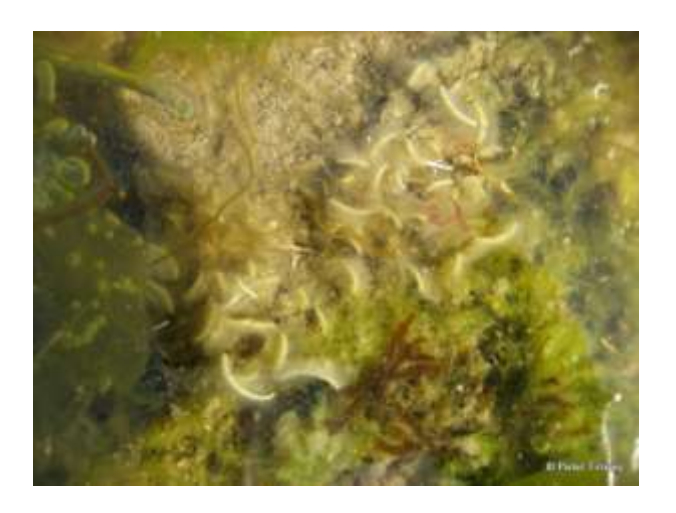
The peacock's tail brown algae ( Padina pavonica ) is common in the Mediterranean but is at the northern limit of its range here on the south coast. It is a UK BAP species and is nationally scarce.