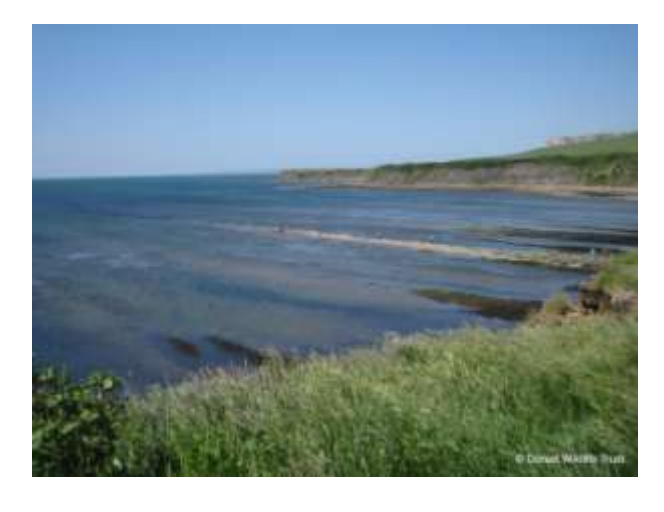
Looking SW from the cliffs at the back of Kimmeridge Bay, the rocky ledges are clearly visible.