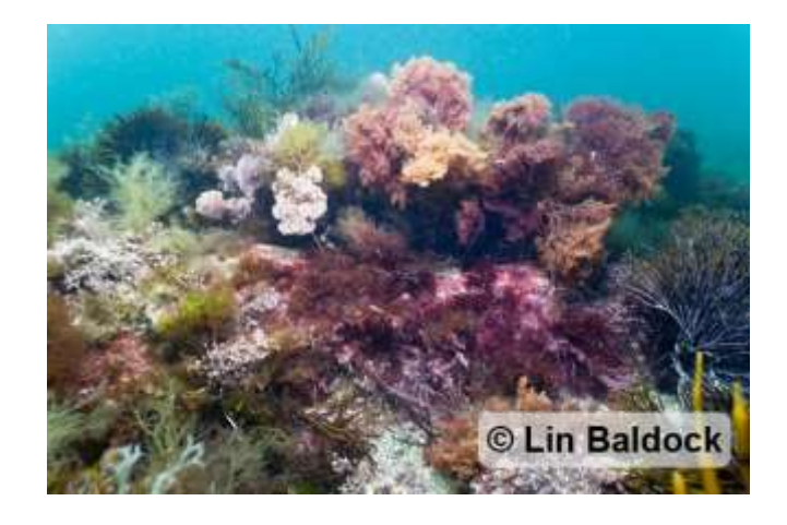
Mixed seaweeds in the shallows of Kimmeridge Bay