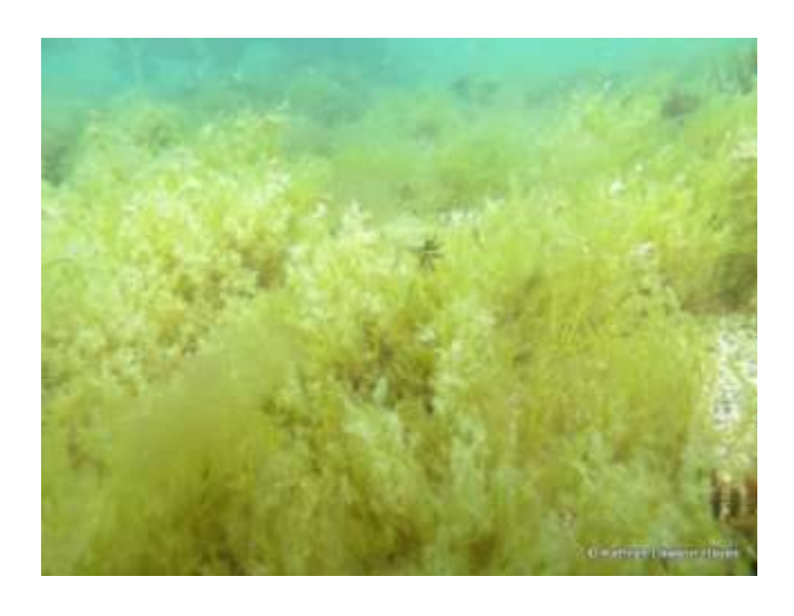
Stalked jellyfish (Haliclystus auricula) on algae