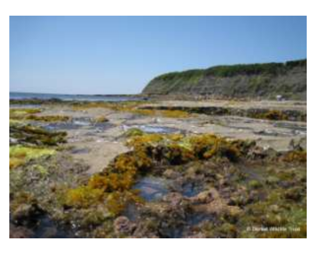
The area known as the Flats contains extensive rockpools and is exposed to the atmosphere for a large proportion of the day during low spring tides. Many unusual species of fish and algae are found here at the extremes of their range.