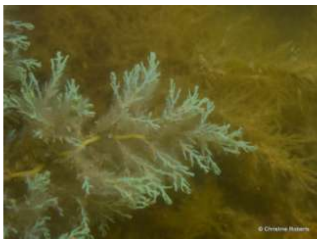
Bushy rainbow wrack (Cystoseira tamariscifolia)