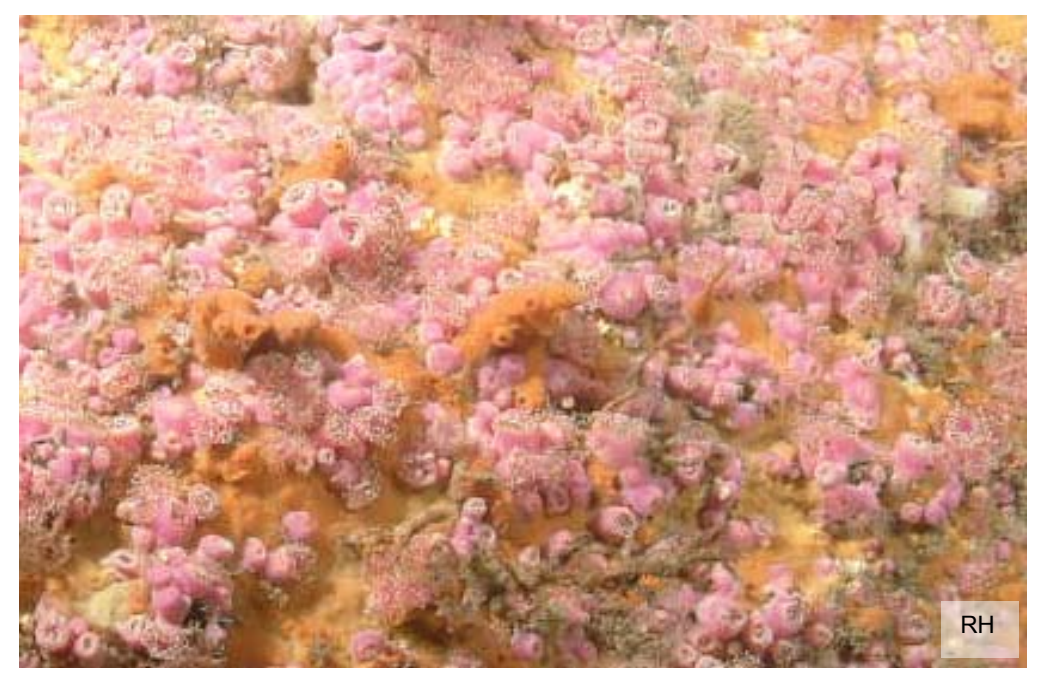
A reef wall covered with Jewel anemones at Maen Mellt.

Maen Mellt was the final dive of the weekend and comprised a steep rocky reef about 0.5 km offshore. After descending through the kelp zone, the reef wall was sporadically covered by jewel anemones ( Corynactis viridis ) and other colourful species such as the Devonshire cup coral ( Caryophyllia smithii ) and the light bulb sea squirt ( Clavelina lepadiformis ).