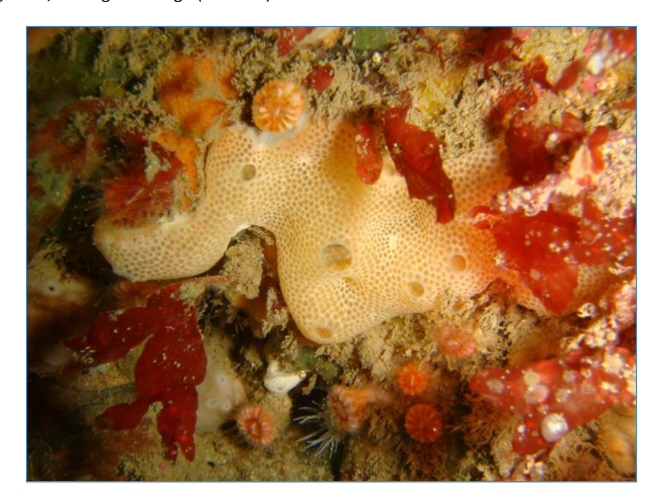
Vidal Rock, Carlingford Lough.