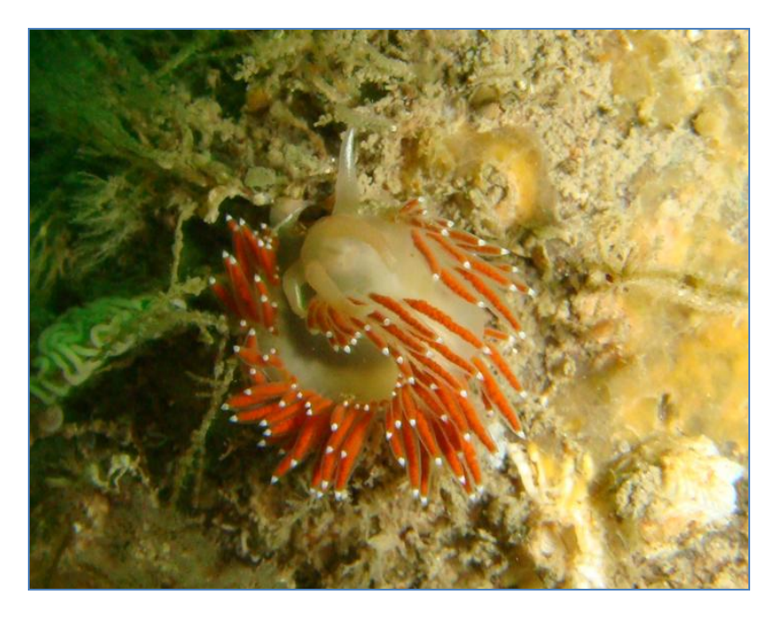
Coryphella gracilis, Carlingford Lough.