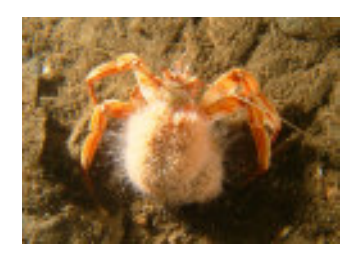
Hermit crabs were common on all transects