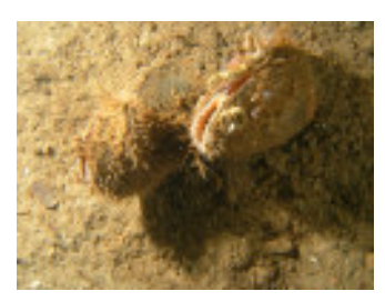
Horse Mussels, Transect 1