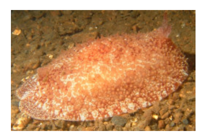
Pleurobranchus membranaceus the Highland Dancer on Transect 1

This transect ran northwards from the end of Transect 3 towards the outlet from the Dubh Loch, covering approximately 150 metres. Fifty six Pachycerianthus were counted during a 26 minute dive between 15 and 20 metres. Towards the end of this transect a number of Nephrops burrows were seen with a couple of quite large individuals moving about.