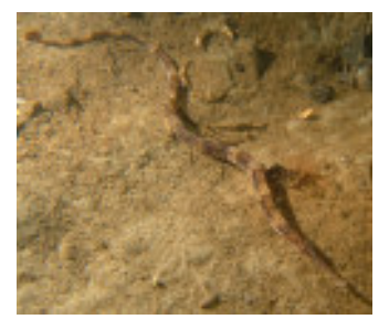
Greater pipefish were seen on transects 1 and 4

In April 2006 a small team organised by the West of Scotland Seasearch Co-ordinator returned to Loch Shira in an attempt to discover more about the Loch Shira population of Pachycerianthus multiplicatus anemones.