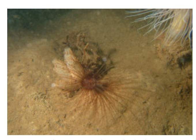
Cerianthus anemone alongside the larger Pachycerianthus.