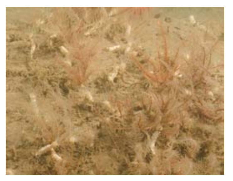
Aggregation of sea cucumbers Ocnus lactea/planci (the white blobs!) (RH)

Two sites close to the jetty on the east side of Point Lynas were surveyed. The seabed here was a mixture of different types, including rocky reef, mixed sediments and mud. There was a gradient from the sheltered, silty region of the bay out to the steeply sloping tideswept headland. In the silty areas the rock had quite high numbers of the silt-tolerant round orange sponge Suberites carnosus. In deeper water, where the tidal flow is greater, there were many plumose anemones Metridium senile and hornwrack Flustra foliacea.