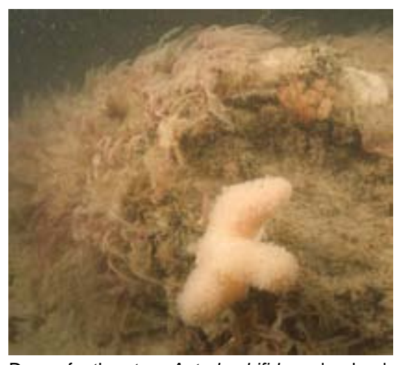
Dense featherstars Antedon bifida and a dead man's finger Alcyonium digitatum (RH)

The first site was to the west of Porth Eilian. The seabed was gradually sloping bedrock, with gullies, pinnacles and crevices, which was in most places covered with dense featherstars and other invertebrates. In one area there was a large aggregation of sea cucumbers (Ocnus lactea/planci). In deeper water the bedrock gave way to sand.