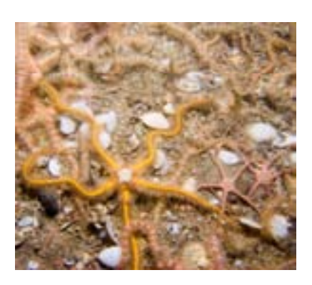
Brittlestars Ophiothrix fragilis (larger animals in this picture) and Ophiura albida (2 small brittlestars on right) (RY)

The fourth site was in Freshwater Bay. The seabed here was very varied with bedrock, boulders, sandy sediment and mixed ground. In places there were brittlestar beds (mainly Ophiothrix fragilis ) on the sandy sediment. The mixed sediment was mostly muddy sand with shell, cobbles and small boulders and was characterised by many brittlestars Ophiura albida and burrowing anemones Cerianthus loydii . The rock had a mainly bryozoan turf and became more silty in shallower water. As with the site east of Point Lynas the rock in deeper water had plumose anemones Metridium senile and dead man's fingers Alcyonium digitatum . Of interest at this site was the small warty crab, or strawberry crab, Eurynome aspersa . Although this species appears to be widely distributed around the UK, it is not often recorded by divers.