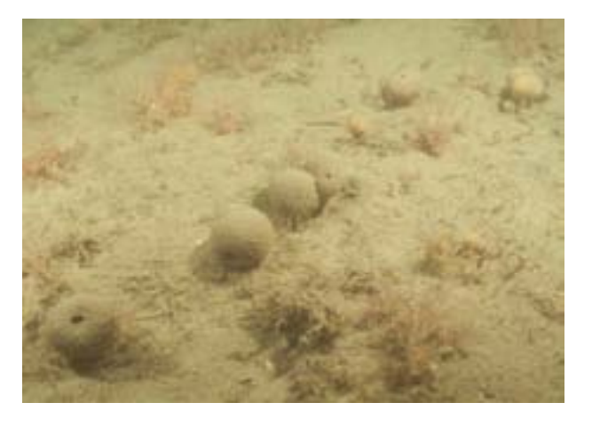
Silty bedrock with the sponge Suberites carnosus (RH)