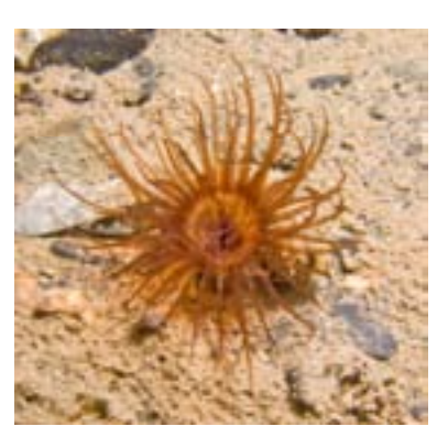
Burrowing anemone Cerianthus loydii (RY)