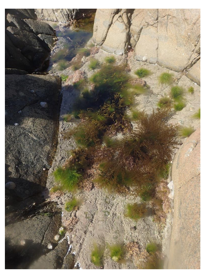
Shallow rockpool with coralline crusts and Corallina officinalis, green Ulva sp. (gutweed) and the brown algae Bifurcaria bifurcata and Sargassum muticum .