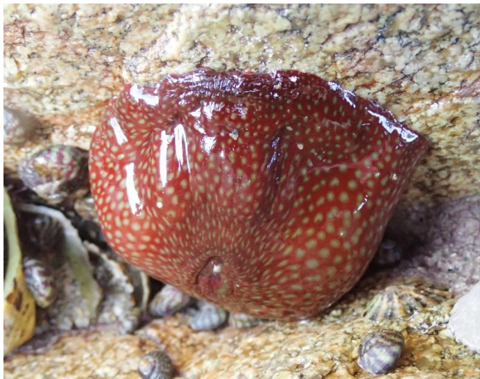
Strawberry anemone Actinia fragacea