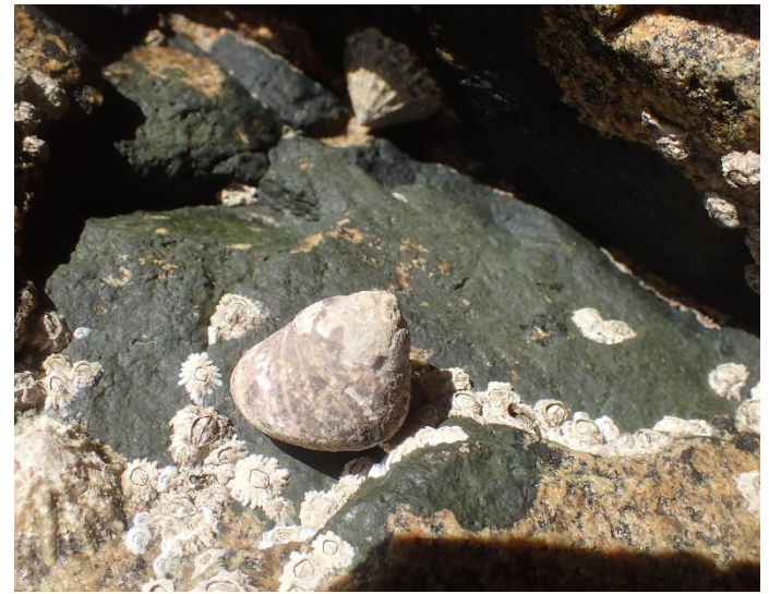
Lichen ( Verrucaria mucosa ?), barnacles, Patella vulgata and Phorcus lineatus on mid-shore boulders