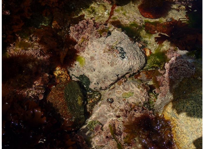
Biotope LR.FLR.Rkp.Cor.Cor (Coralline crusts and Corallina officinalis in shallow eulittoral rockpools)