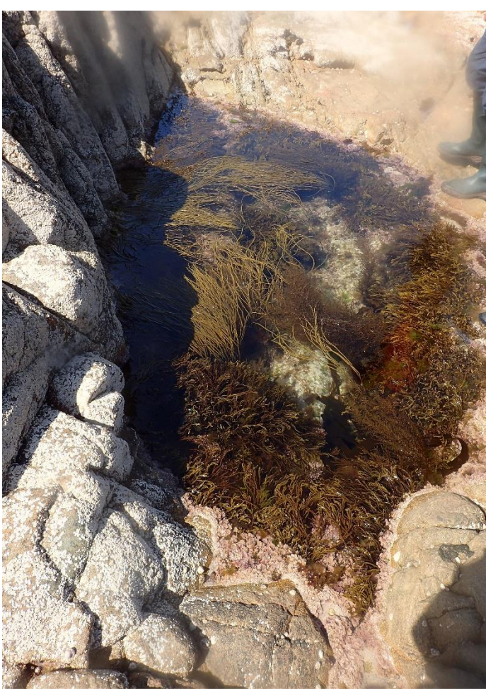
Biotope LR.FLR.Rkp.Cor.Bif ( Bifurcaria bifurcata in shallow eulittoral rockpools)