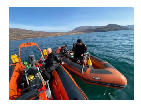
The Little Loch Broom dive team in action (Iain Dixon)