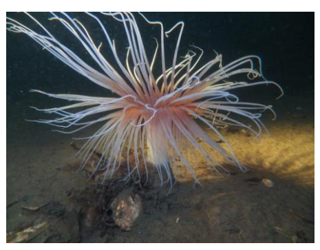
A Loch Fyne Fireworks Anemone