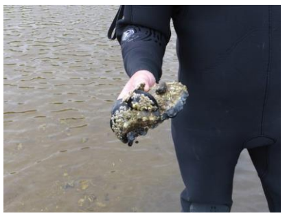
Some of the very large Oysters found in Loch Fyne