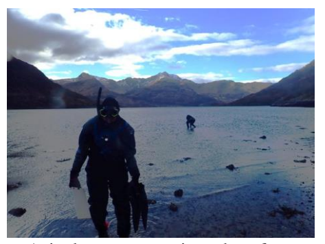
A tired surveyor coming ashore from Loch Hourn