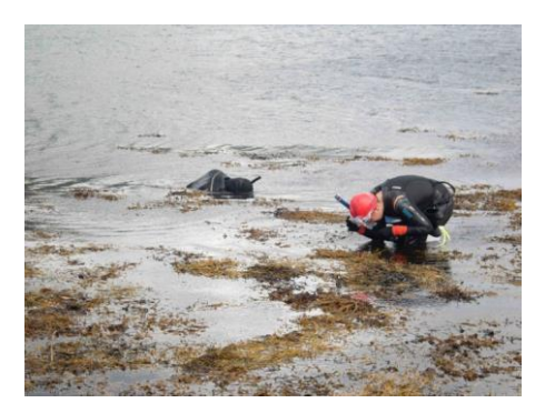
Once again Free Divers played a prominent part in West Coast Seasearch surveys