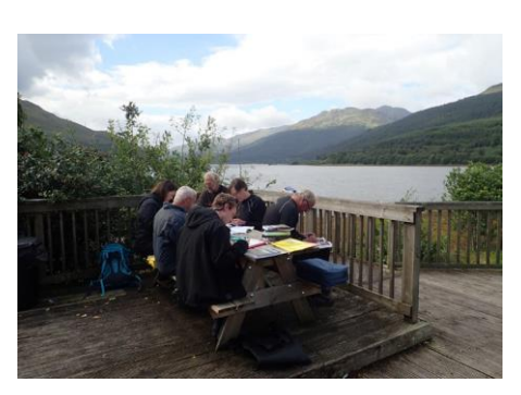
Participants in one of the mentoring days hard at work form filling.