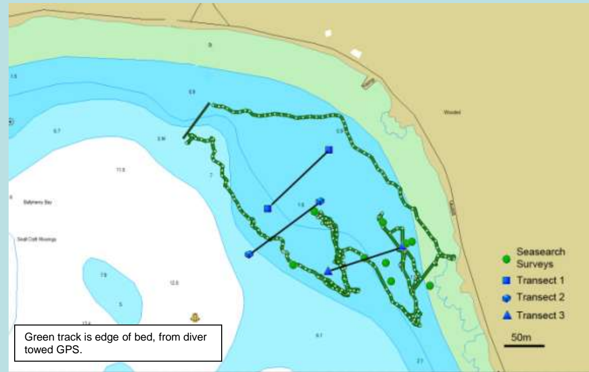
Above: Map of Ballyhenry Seagrass Bed.

This Seasearch project will give us a much better idea of the current state of our eelgrass beds, and will provide baseline data so that we, or other researchers, will be able to return in the future to see how they are faring. Eelgrass beds are recognised as important habitats for biodiversity under European legislation including the Habitats Directive and Water Framework Directive. All the data collected by the Seasearch volunteers will be used by Northern Ireland Environment Agency for assessment of eelgrass bed condition and future monitoring.