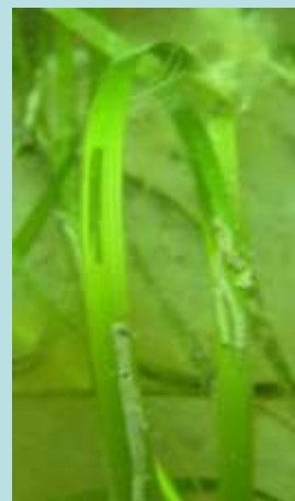
A small tube worm was recorded on many seagrass blades. A sample was taken and identified by Daniel O'Neill, Seasearch volunteer and NIEA marine taxonomist. The worm was confirmed as Nicolea zostericola . This species, as the name suggests, is an obligate associate of the eelgrass Zostera marina . Right: Worm in situ , on Seagrass blades. Below worm in lab.

The invasive seaweed Sargassum muticum (wireweed or japweed) was found towards the edge of the Ballyhenry Bay Seagrass bed. It is thought that this species might compete with Zostera marina . Flat fish species including many juveniles unidentifiable to species level, flounder and plaice were present around the base of the eelgrass. Two-spot goby Gobiusculus flavescens and fifteen spined stickleback Spinachia spinachia were frequently sighted around the upper part of the fronds.