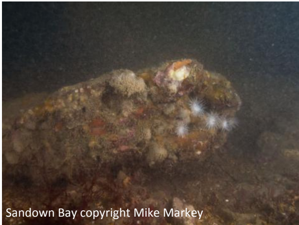
Sandown Bay

Our first dive day of the year took place in April, we attempted to dive Utopia (a rMCZ off the east coast of the Isle of Wight) but unfortunately the poor visibility meant that only one pair of divers made it to the sea bed. In the afternoon we were looking for black bream nests in Sandown Bay , unfortunately we didn't find any nests but there was a rocky reef to survey.