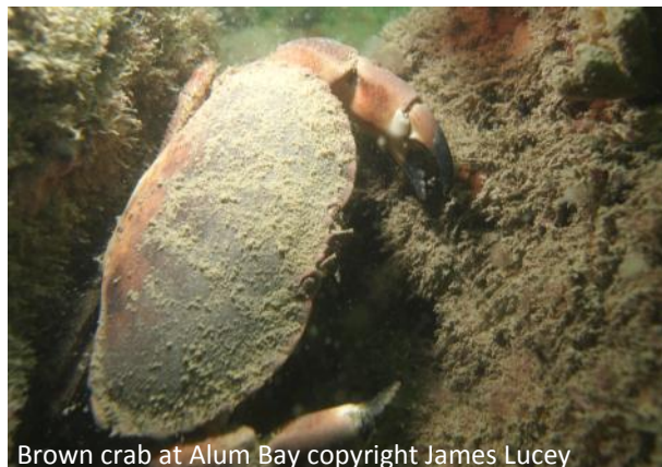
Brown crab at Alum Bay

Alum Bay is also within the Needles rMCZ and it's another site we visited a couple of times to survey slightly different areas. There's a huge variety of seaweed and attached life growing on the soft chalk cliffs and boulders at the bottom and because the rock is so soft there are plenty of animals living inside it too.