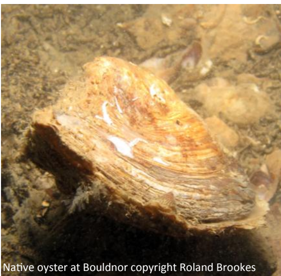
Native oyster at Bouldnor

Over the last few months we have been busy entering the data you have provided and looking through all of your photos. This data has all been biotope coded which means a habitat type or types have been assigned to it based on species list, site descriptions and photos. This gives a bit more information about the area as a whole and helps identify vulnerable habitats. The data will be sent to Natural England in January 2015 and will help to inform the public consultation on the second tranche of Marine Conservation Zone (MCZ) designation which will take place early in 2015. See the following pages for more information about which local recommended MCZs were surveyed this year and what we recorded.