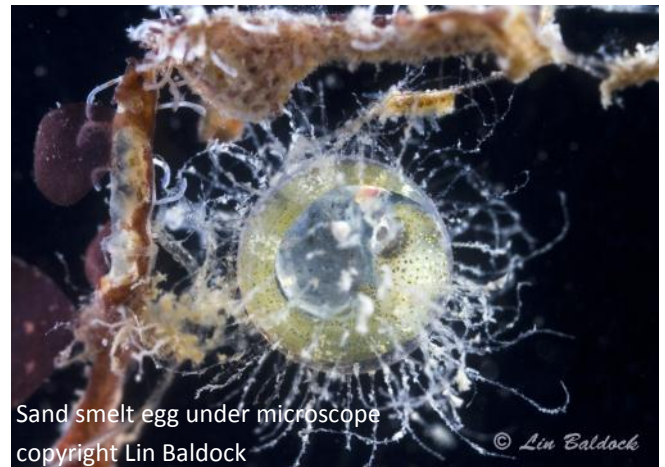
Sand smelt egg under microscope

The next dive site we visited was Scratchell's Bay on the south side of the Needles (but still within the Needles rMCZ). We hadn't visited this site before but we surveyed it twice this year along with another site nearby called the Kampen wreck . Scratchell's Bay had large lumps of rock with plenty of attached life and some big edible crabs hiding under the rocks. Lin sampled a piece of seaweed from the site and found this sand smelt egg attached. One group dived the Kampen wreck which lies in between the Needles as an extra dive, the visibility improved and lots of interesting species were recorded including a large lobster, however no wreckage was seen!