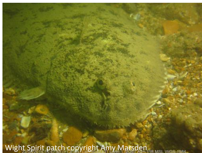
Wight Spirit patch

We picked a couple of new sites within the Needles rMCZ using the chart and selecting areas which looked like rocky outcrops. The first of these we named ' Wight Spirit Patch ' as it was found by Wight Spirit skipper Dave. It was an area of boulders, cobbles and pebbles with lots of attached life – mainly sponges and hydroids. Few mobile species were spotted but this large sole was photographed by Amy.