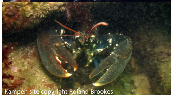
Kampen site