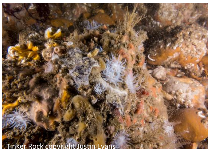
Tinker Rock

The second new site also within the Needles rMCZ was Tinker Rock , another rocky outcrop with some large boulders. The species recorded here differed dramatically depending on the direction in which the surveyors swam. Some reported a dominance of sponges, hydroids and ascidians while others saw mostly branching bryozoans. Both of these new sites provided valuable information for areas we haven't previously visited and we recorded native oysters (which are important for MCZ designation) in both.