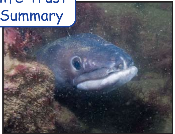
Conger eel