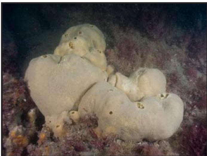
Suberites sponge