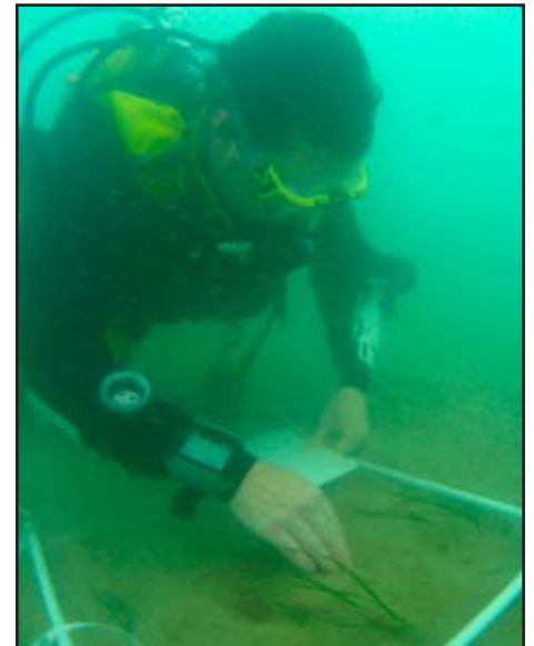
Counting seagrass

Three dives were conducted at the Hanson Aggregate extraction zone 372/1 as part of an ongoing survey programme. This is an extremely diverse and stable site. Sponges such as Suberites carnosus , Polymastia