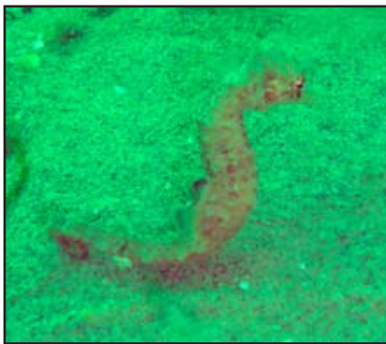
Short snouted seahorse, by Angela Gall

The area hosts some of the best chalk reefs in the country and these BAP priority Habitats were surveyed at several sites on the east of the Isle of Wight. Culver Cliff is a rocky chalk reef with some mixed ground at a depth of 7 to 9 meters. The site is rich in marine life, with several species of red algae in the shallower areas. There