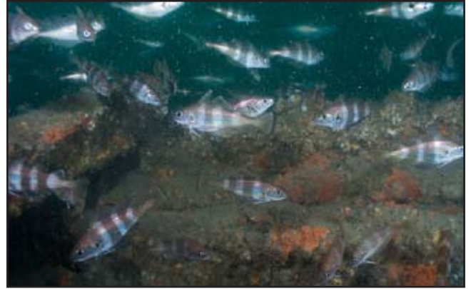
Bib, by Mike Markey

Eight wrecks lying on a variety of habitats from sand to chalk reef were investigated in 2008. Dominant species included hydroids and bryozoans, notably hornwrack, Flustra foliacea , deadmans fingers, Alcyonium digitatum , velvet swimming crab, Necora puber and sponges including the goosebump sponge, Dysidea fragilis . Fish were frequent, especially bib, Trisopterus luscus , and tompot blennies, Parablennius gattorugine . The BAP species short snouted seahorse, Hippocampus hippocampus was found on the Mystery Wreck.