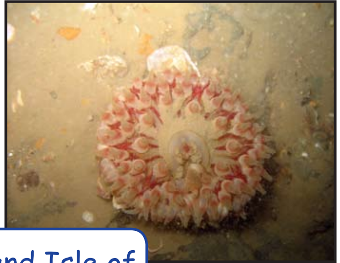
Dahlia anemone