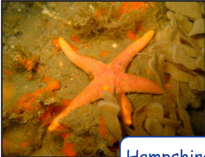
Bloody henry starfish