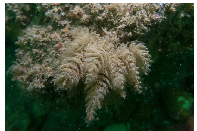
Bugula plumosa bryozoan and other faunal turf on chalk reef at South Foreland 20/07/14