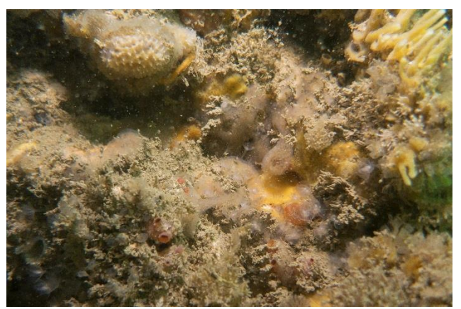
A mixed faunal turf on chalk reef at South Foreland 20/07/14