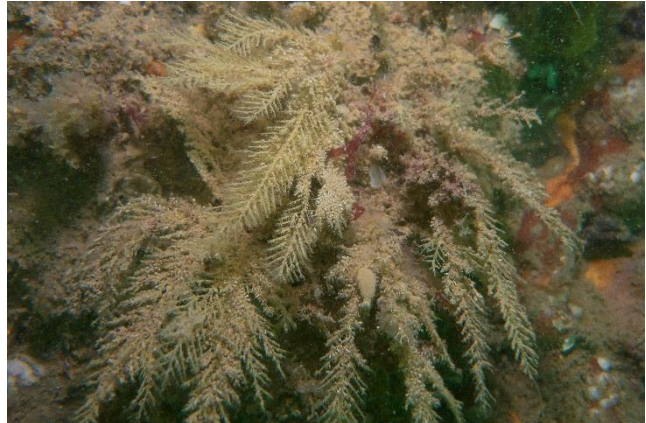
Halecium halecinum hydroid on chalk reef at South Foreland 20/07/14

South Foreland Reef 20/07/2014, 16:30 Position: 51.14338N, 1.38633E