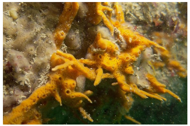
Amphilectus fucorum (shredded carrot sponge) on chalk reef at South Foreland 20/07/14

Surveyors recorded outcropping subtidal chalk bedrock reef and boulders, and moderate and high energy circalittoral rock, including the biotope characterised by sponges with Nemertesia and Alcyonidium diaphanum . Areas of mixed sediment or sand were recorded between the chalk reef.