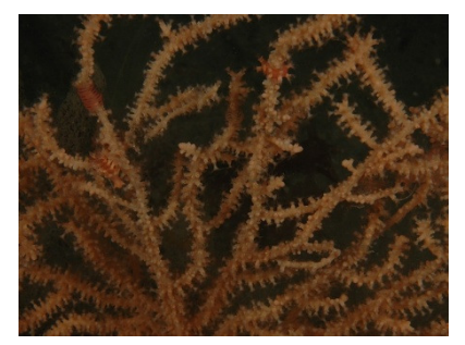
Two Tritonia nilsodhneri with eggs on a pink sea fan on a reef off Worbarrow Tout.

Purbeck Marine Wildlife Reserve Six survey events, 146 species and groups and seven MNCR biotopes. Mixed faunal turf, mixed sediments and some soft rock communities described from under the ledges at Kimmeridge ledges. Also, areas with dead maerl in the mixed sediment were noted off the seafan reef, just inside the western edge PMWR. In 2009 there were fewer records form here than in previous years. The most frequently sighted species throughout the area were encrusting pink algae, Dysidea — a common sponge to Dorset, the antenna hydroid ( Nemertesia antennia ) and the crater sponge Hemimycale columnella . Less frequently seen species included the trumpet anemone ( Aiptasia mutablis ), Devonshire cup coral ( Caryophyllia smithii ), three records of pink sea fans ( Eunicella verrucosa ), and one common sea urchin ( Echinus esculentus ). Records