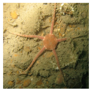
Ophiura albida on sandy mud at Chesil Cove FR

Over to the east of the bay, there were several more records, in large part due to a days' diving done at Chesil Cove and Blacknor South on a DWT charter in May. Of the dive off Chesil Cove, the habitat was predominantly sand and gravel with queen scallops ( Aequipecten opercularis ), hydroids (including Kirchenpauria ) and the sand brittlestar Ophiura albida being the most abundant species. Fish life was generally sparse but one species observed that is not often recorded was the butterfly blenny ( Blennius ocellaris ). At the site south of Blacknor, the habitat was large boulders on gravel, with biotopes of Laminaria hyperborea and red algae on infralittoral rock. The most abundant species recorded were shredded carrot sponge ( Amphilectus fucorum ), kelps, Calliblepharis ciliata , Delessaria sanguinea and a range of short and tall hydroids including Obelia geniculata . Also present in low abundance were Devonshire cup coral ( Caryophyllia )