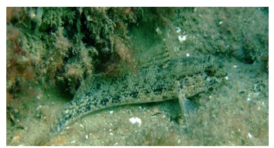
A Couch's goby (Gobius couchii), recorded off a patch reef in Poole Bay last September by Suzanne Munnelly. The identification was confirmed using this photo that Suzanne took. Dorsal fin colouration and a lack of the prominent black spot at the front of the fin, distinguishes this species from the more common Black goby.