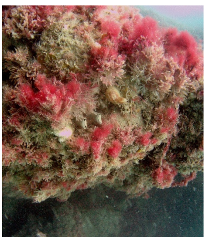
Patch reef with red algae and abundant Chartella papyrace, Gerry's Pinnacle in Poole Bay. KD

Poole Bay A total of 177 species and groups were recorded from eight survey records and with eight MNCR biotopes. The sites from this area in the middle of the Bay and near the harbour entrance tend to be turbid and quite silted. Consequently, although the tops are in the 5-10m range they do not support any kelp communities. Several surveys were made on the patch reefs in the Bay. Red weeds were common in these infralittoral zones instead of kelps and the fish life appeared to be plentiful- mostly bib (Trisopterus luscus) and corkwing wrasse (Crenilabrus melops). Other species with high frequency and abundance included goosebump sponge ( Dysidea fragilis ), crater cponge ( Hemimycale columnella ), encrusting pink algae, the bryozoa hornwrack and Chartella papyracea. Edible crabs (Cancer pagurus) and velvet swimming crabs (Necora puber) were also frequently recorded with varying abundances although there were no common lobsters recorded from the reefs. However, one Couch's goby (a protected and rather rare species) was recorded from an inner patch reef in September (see over page). Another Trapania pallida was sighted on another patch reef named Gerry's Pinnacle, to the south of the Bay.