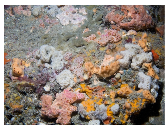
Faunal turf of sponges with silted Pycnoclavella aurilucens in the top left. Blackers Bump LB

DurIston Marine Research Area & Swanage Bay From this popular and accessible area 248 species and groups were recorded, 26 survey events and 13 MNCR biotopes from the infralittoral and cicraclittoral zones. These included mixed faunal turf, foliose red seaweed on infralittoral rock on Peveril Ledges, fouling faunal communities from wrecks in Swanage Bay and mobile sand with sparse fauna in DurIston Bay. This latter site initially appeared quite barren but eventually led to some interesting sightings including a juvenile reticulated