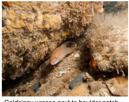
Goldsinny wrasse next to boulder patch on sand and gravel, Grove Point. RY

smithii ) and the brown alga, pennyweed ( Zanardinia prototypes ). In comparison to the survey off Chesil, this site had several fish species present, many such as wrasse and pollack, recorded as 'occasional' in abundance.