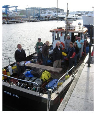
August at Poole Quay

2009 was another good year for Seasearch in Dorset, with many courses being held, lots of dive weekends and an increase in the number of forms from the previous year. Once again we lost a few opportunities due to the weather but overall we had a good number of Seasearch charters going out, with two from Weymouth and two from Poole, plus specialist surveys and evening dives. This is of course in addition to all of the contributions made by dive clubs and buddy pairs from across the country who come to dive in Dorset. A table summarising the number of species recorded is presented on the last page, with summaries of all of the species and habitats recorded area by area from page 3 to 5. A short description of biotope identification using Seasearch data is given on page 6.