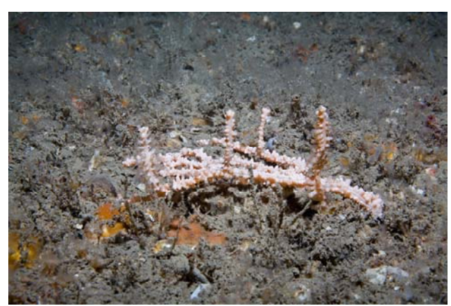
Flattened sea fan regrowing vertically - Lin Baldock

Two sites to the south-east of Lyme Regis – Cod Ledge and The Silvas – had good populations of pink sea fans Eunicella verrucosa . There was evidence of past trawling