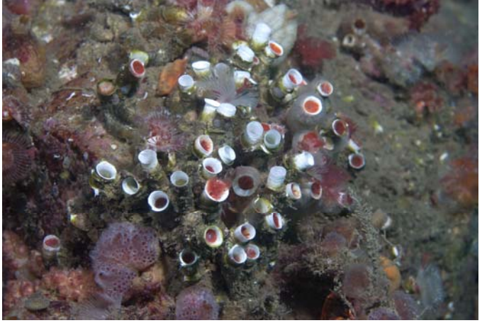
Serpula vermicularis colonies – Sally Sharrock

The fourth site, to the south-east of Lyme Regis, was a flat sediment seabed which contained maerl. This was an incredibly species rich site with colonies of organ pipe worm Serpula vermicularis being visually dominant, although not yet forming reefs, many