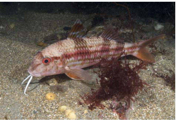
Red mullet, night dive - Paul Naylor

Wembury Bioblitz in conjunction with the Natural History Museum & the Marine Biological Association took place for a 24 hour period in August. Various projects were organised which included both the general public and experts and a species count was collected from below sea level to the top of the cliffs. Devon Seasearch was involved with a display for the public and in a night dive and a dawn dive on a site in Wembury Bay, and also assisted with plankton collection. Seasearch added 64 underwater species to the total collection including ten species of sponge,