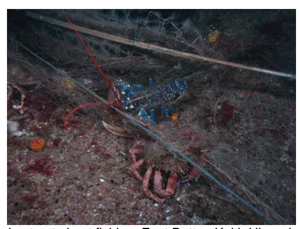
Lost net ghost fishing, East Rutts

Within Bigbury Bay the Persier reef was surveyed and found to have a continuing good population of Steven's goby Gobius gasteveni , both adults and juveniles. On the wreck of the Persier both pink sea fans and sea fan anemones were recorded together with a number of small sea fan recruits, the football sea squirt Diazona violacea and the tiny pink fingers Alcyonium hibernicum .