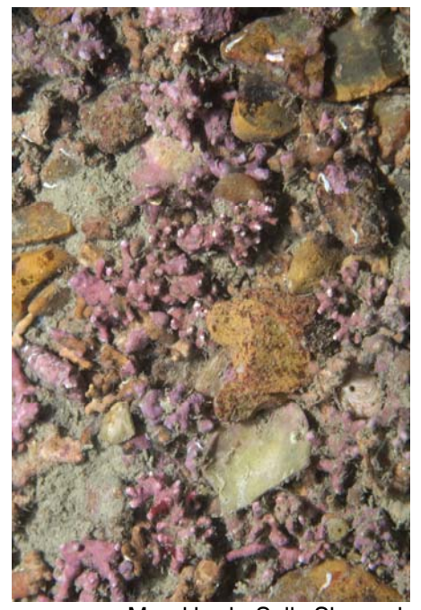
Maerl bed - Sally Sharrock

An inshore site to the west of Lyme Regis – Tescos reef – with north facing