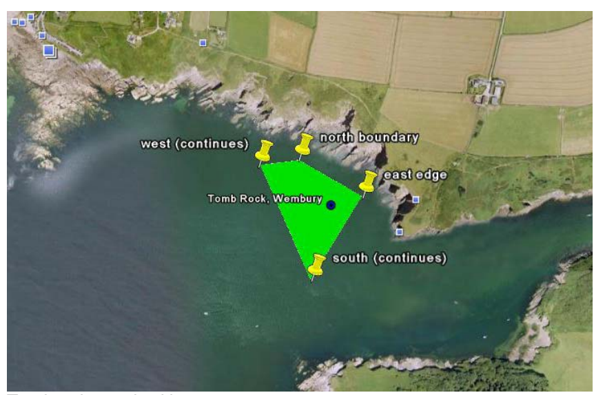
Tomb eelgrass bed known extent

Two eelgrass beds within the estuary of the Yealm are known, mapped, and have been surveyed in past years. A third bed, the Tomb eelgrass lies outside the sandbar at the entrance to the Yealm estuary, in Wembury Bay itself and was recorded in 2008. This year Seasearch surveyed it using floating GPS to try and ascertain the extent and health. The