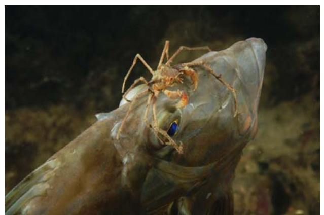
John Dory being cleaned

Forms were also received from dives at Babbacombe Bay, some due to concern over recently installed moorings (concrete filled tyres with heavy chains), to record settlement growth and bottom effect. A set of forms from Oddicombe recorded a cleaning station where groups of John Dory Zeus faber were being cleaned by spider crabs, a previously unknown event.