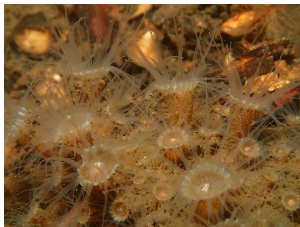
The sandy creeplet anemone Epizoanthus couchii, Loch Goil