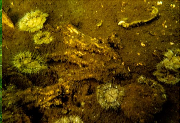
Evidence of past serpulid reefs, West Loch Tarbert (Owen Paisley)