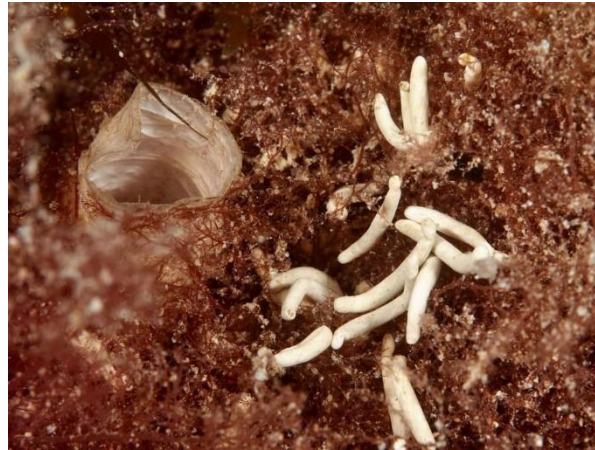
Parchment worm Chaetopterus variopedatus and white faecal pellets, Arran (David Kipling)