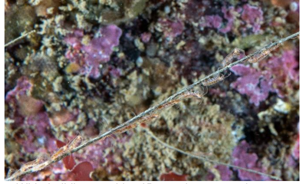
Whip-building amphipod Dyopodos sp, north coast Scotland (Iain Dixon)