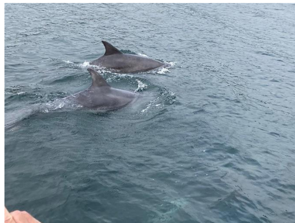
Dolphins! Always intensely exciting when they appear (Iain Dixon)