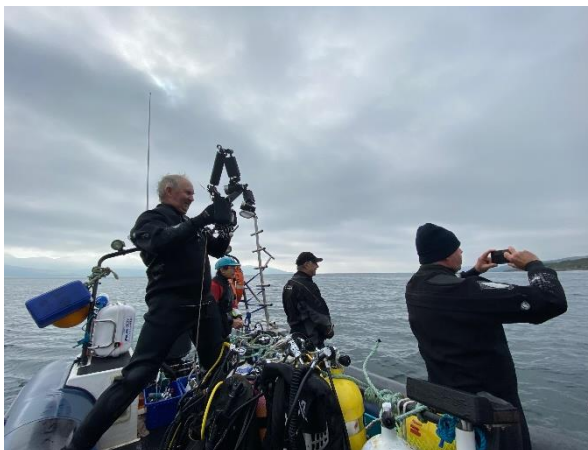
Everything stops for a dolphin flypast at Cour

Seasearch dives were undertaken at the proposed locations for two new open cage salmon farms - one off the undeveloped northeast coast of Arran at Millstone Point in early July and the other just north of Cour on the east side of the Kintyre Peninsula in August 27-29. Although no priority marine habitat or species were recorded, the Seasearch surveys recorded some unusual species records and provided a more substantial species list than that recorded in the visual survey reports statutorily prepared for the proposed fish farm developments.