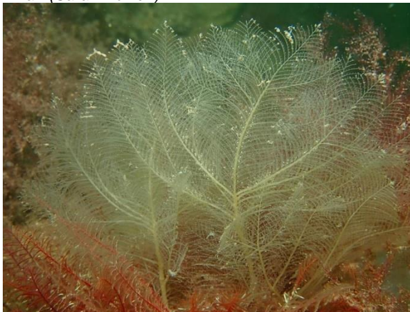
The hydroid Schizotricha frutescens, Arran