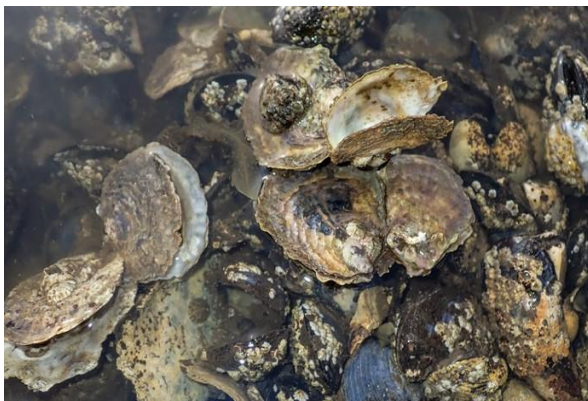
Native oysters Ostrea edulis

On the rarer side of things, there was a first record for the east coast near St Abbs Head of the nudibranch Hancockia uncinata in September (several individuals). As mentioned above, the diminutive goby Lebetus scorpioides and a streaked gurnard Chelidonichthys latoviza were also recorded around Arran (the streaked gurnard is only the second ever record for Scotland). Species that are undoubtedly under-recorded in Scotland's waters, but which are increasingly being spotted by keen Seasearchers (often as 'bycatch' in photographs) include the numerous but cryptic and easily overlooked brachiopods such as Novocrania anomala , foraminiferans, small inconspicuous hydroids, the whip-building amphipod Dyopedos sp. and tiny cryptic tubicolous polychaetes such as Euchone spp.