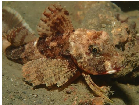
Streaked gurnard Chelidonichthys lastoviza