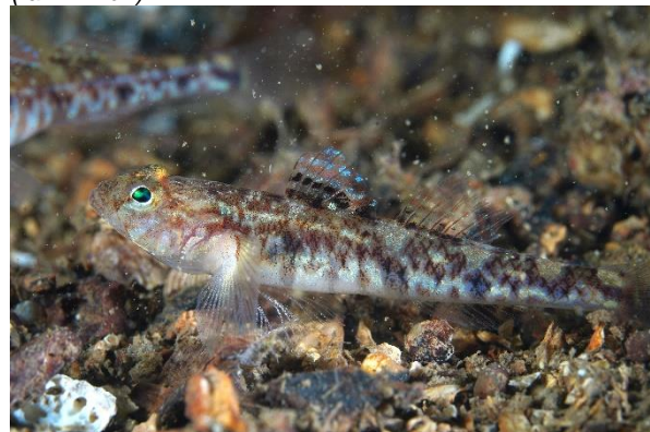
Painted goby Pomatoschistus pictus, Cour (Iain Dixon)