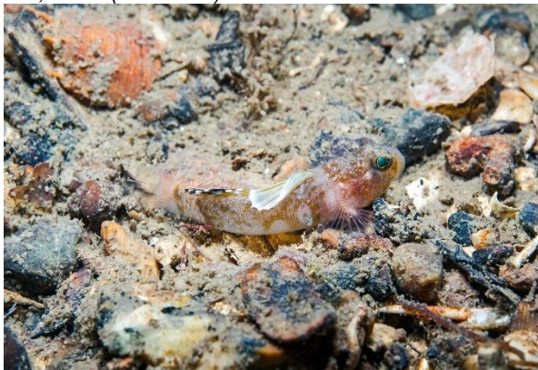
Diminutive goby Lebetus scorpioides, Arran