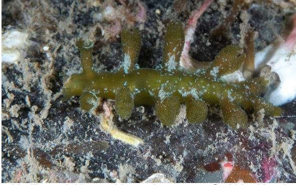
Nudibranch Hancockia uncinata near St Abbs Head