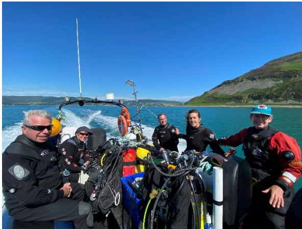
Some of the survey team enjoying the sunshine at Holy Isle, Arran (Iain Dixon)

Along with the gorgeous weather, the sea was a brilliant blue colour due to a coccolithophore bloom that afflicted much of the Firth of Clyde through June last year, and which reduced underwater visibility somewhat. Much of the seabed and associated life was decorated with clumps of white material, presumed to be dead coccolithophores and individual coccoliths (see Kipling, 2022, for an account of these observations). In addition, the presence of the bloom was also reflected in accumulations of unusually pale-coloured faecal pellets from the filter-feeding tubicolous polychaete Chaetopterus variopedatus (parchment worm).