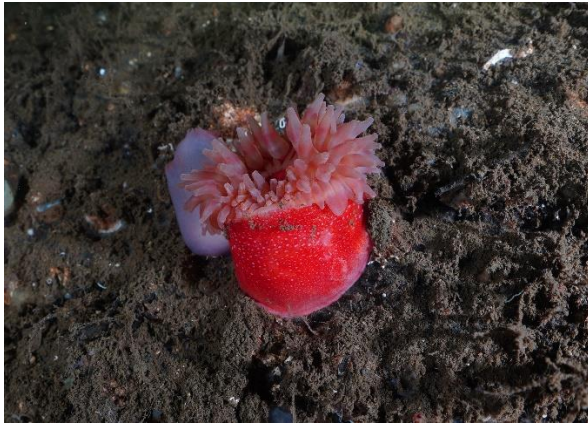
Horseman anemone Urticina eques, Loch Long