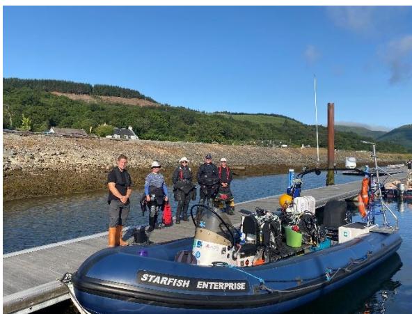
The survey team at Wreckspedition's base, Holy Loch (Iain Dixon)

With numbers still restricted, five Seasearchers assembled at the Holy Loch marina for diving, fun and recording over the weekend of July 17-18. Borne away on Wreckspedition's Starfish Enterprise, six sites in Lochs Long and Goil were visited, together with the obligatory lunch break at the wonderful Boat Shed café.