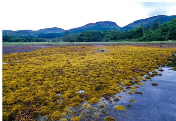
Crofter's wig Ascophyllum nodosum ecad mackayi , (the bladderless unattached form of the egg wrack A. nodosum ), Loch Melfort (Owen Paisley)