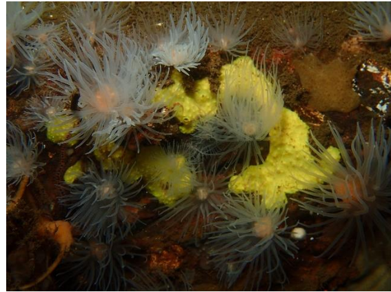
Yellow encrusting sponge Aplysilla sulfurea, Loch Long (Sarah Bowen)