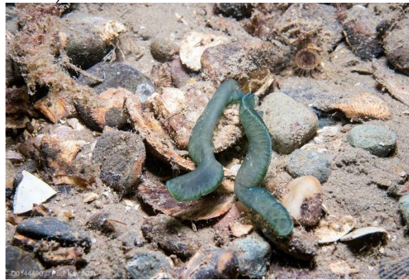
Spoon worm Bonellia viridis, Arran