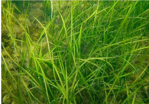
Seagrass Zostera marina , West Loch Tarbert (Owen Paisley)