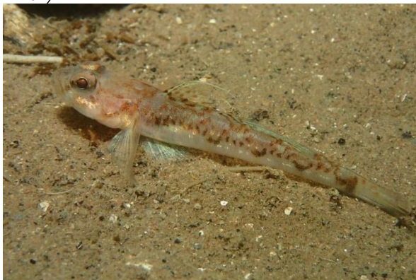
Jeffries goby Buena jeffreysii, Millstone Point