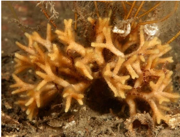
Monkey puzzle bryozoan Omalosecosa ramulosa, Arran