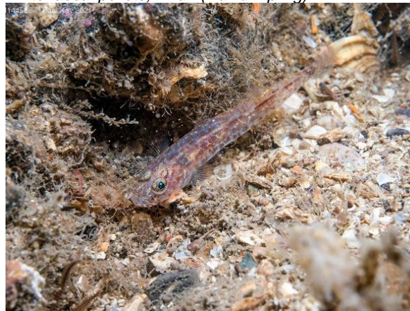
Jeffries goby Buenia jeffreysii, Arran