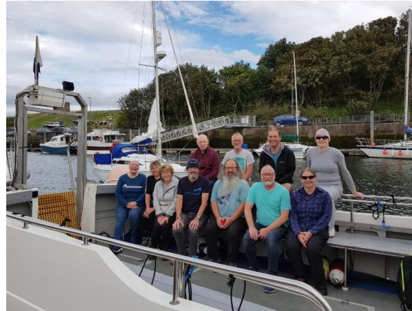
Seasearch team, Eyemouth (Iain Easingwood)