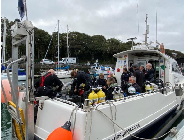
Meeting and kitting up on the Jacob George, Eyemouth