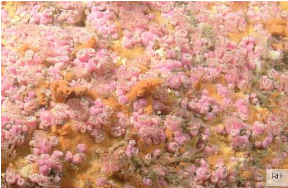
A reef wall covered with Jewel anemones at Maen Mellt, photographed by Rohan Holt.

Maen Mellt was the final dive of the weekend and comprised a steep rocky reef about 0.5 km offshore. After descending through the kelp zone, the reef wall was sporadically covered by jewel anemones ( Corynactis viridis ) and other colourful species such as the Devonshire cup coral ( Caryophyllia smithii ) and the light bulb sea squirt ( Clavelina lepadiformis ).