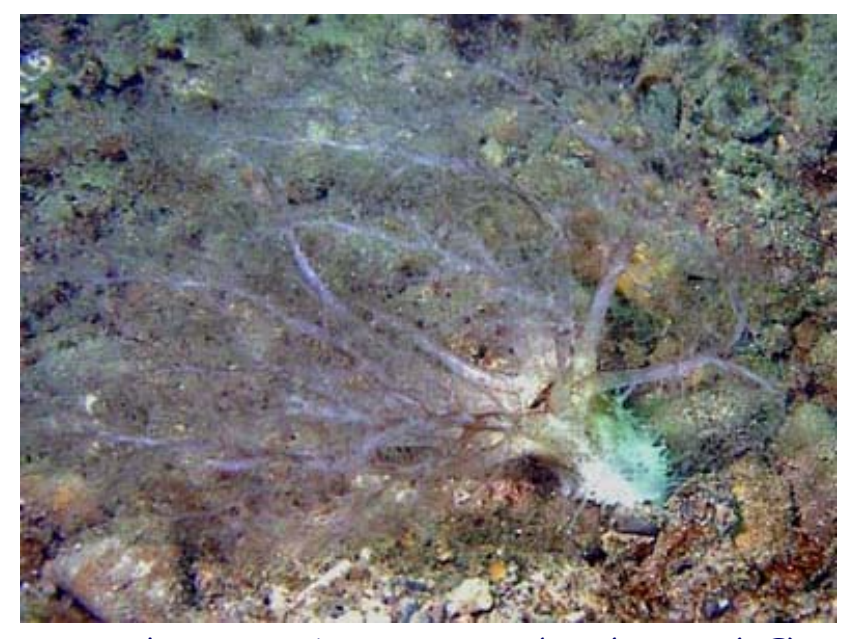
Gravel sea cucumber Neopentadactyla mixta (HE)