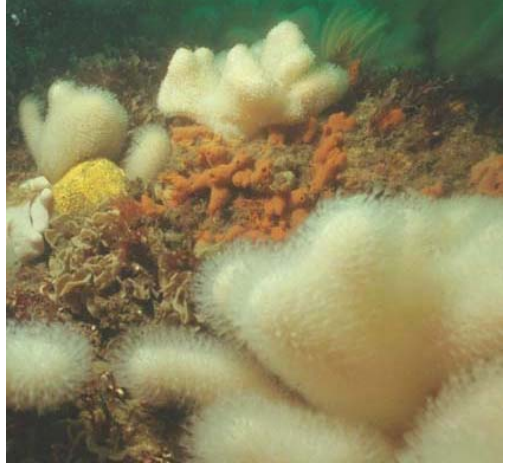
Sponges (Esperiopsis fucorum and Cliona celata), soft corals (Alcyonium digitatum) and bryozoans (Flustra foliacea) at Trwyn yr Wylfa (CW)