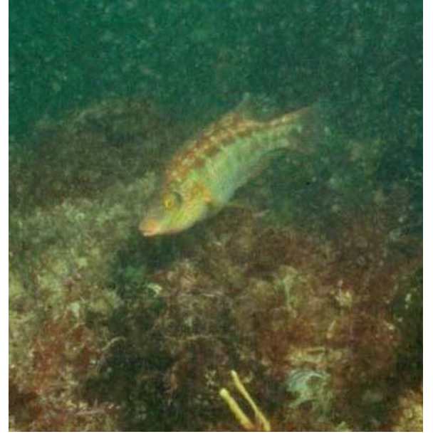
Corkwing wrasse above its nest of algae (CW)