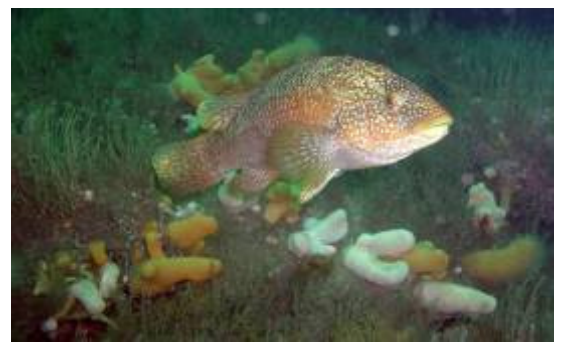
Ballan wrasse ( Labrus bergylta ), Tubularia indivisa and Alcyonium digitatum by SS Thesis, Sound of Mull (CD)

At the southeastern end of the Sound, the SS Thesis is clad with soft corals (Alcyonium digitatum) and lies on a boulder slope rich in life, including oatenpipe hydroids (Tubularia indivisa), Coryphella lineata nudibranchs, leafy bryozoan (F.foliacea), Tritonia hombergii and their A.digitatum prey, and numerous wrasse, with rich seaweed growth on the shallower bedrock reef. Interesting species recorded here included the imperial anemone (Capnea sanguinea) and the stalked barnacle (Scalpellum scalpellum). On the under-recorded