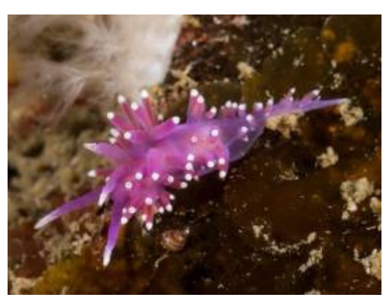
The nudibranch Flabelline pedata at Skelly pinnacle, St Abbs Head (JA)

St Abbs is a popular diving destination for divers in the southeast of Scotland and, even more predominantly, the north of England. Regularly recorded sites such as Anemone Gullies, Black Carr and Skelly's Hole again feature in 2012. The forms were submitted from a range of sources in 2012 including the St Abbs and Eyemouth Voluntary Marine Reserve Ranger Georgia Conolly (four Survey forms) and from various visiting Seasearch divers from London, Bristol, Harrogate, Bury St Edmonds and Ipswich. Allison Gleadhill submitted three Survey forms from Skelly Hole, Anemone gullies and Black Carr.