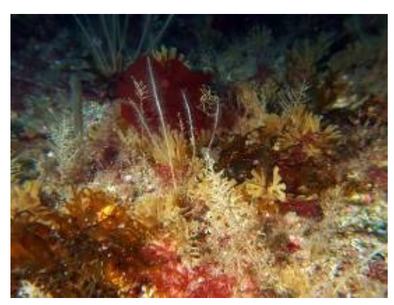
Dense bryozoan and hydroid turf, Isle of Muck (DW)

Godag is a small rocky islet off the northern coast of Muck fringed with kelp forest gently descending to cobbles that slope to a vertical wall at 16m. The only site surveyed off north Muck, it appeared siltier than other sites with lower biodiversity than expected on the wall. It is speculated that this may be due to scallop dredging in the channel between Muck and Eigg. The PMF link (M.molva) was recorded here. Diving Eagamol, a tiny island off the north west of Muck revealed an unusual habitat dominated by the bryozoan Securiflustra securifrons carpeting gently sloping rock from 20-30m with finger bryozoan