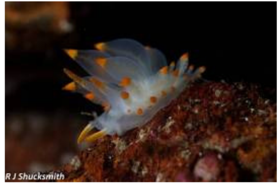
Eubranchus farrani nudibranch, Shetland

Swarta Skerry was covered in kelp (L.hyperborea) and the Yarrell's Blenny (Chirolophis ascanii) and the hydroid H.catharina were recorded here. Live horsemussels ( M.modiolus ), a PMF, mixed with broken shell and patches of shell sand between and the chameleon prawn Hippolyte varians were recorded at Dury Voe. Abundant keelworms (Spirobranchus triqueter), indicating a large degree of scour and exposure, were noted on vertical surfaces at Hoo Stack, east mainland Shetland, where Scinà's weed (Scinaia spp) and smallspotted catshark (Scyliorhinus canicula) were also recorded.