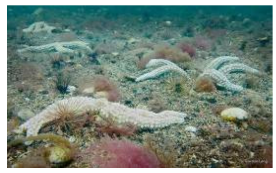
Spiny starfish ( M.glacialis ) and burrowing anemones ( C.lloydii ) on dead maerl bed, southeast Holy Isle, Arran (GL)

Fortunately the wind dropped the following day, allowing multiple sites southwest of Arran to be surveyed in an area recorded as an historic herring spawning site, thought likely to be a potential site for a maerl bed. An area of boulders and small bedrock outcrops, protruding from shell gravel seabed and turfed with sea firs (Nemertesia antennina and N.ramosa), red seaweed and bryozoans (including Disporella hispida, Fenestrulina malusii, Puellina innominata), descends to an underwater landscape of large maerl