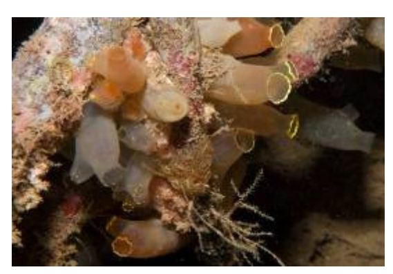
Yellow-ringed seasquirts ( Ciona intestinalis ) and hydroids cluster on SMS Karlsruhe (JP)

In deeper water to the starboard side of the deck, a layer of brittlestars ( O.fragilis ) covers a rich horsemussel bed ( M.modiolus ). Broken mussel shell fragments cover the seabed, with encrusting sea mats ( P.trispinosa ), keelworms ( Spirobranchus triqueter ) and saddle oysters ( Anomia ephippium ) among the debris. Amongst the fragments of broken shells, a solitary rare Fan mussel ( Atrina fragilis ) was recorded, its bright yellow mantle exposed.