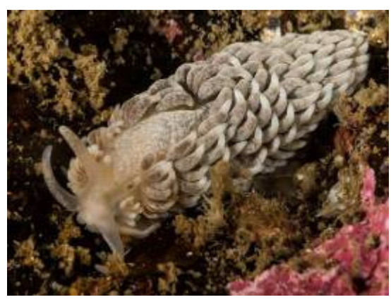
The grey nudibranch Aeolidia papillosa at Skelly pinnacle, St Abbs Head (JA)

One dive in St Abbs harbour itself, a rare opportunity, revealed perhaps unsurprisingly many discarded crab claws and scallop shells, whilst another dive to the east of the harbour wall recorded discarded litter.