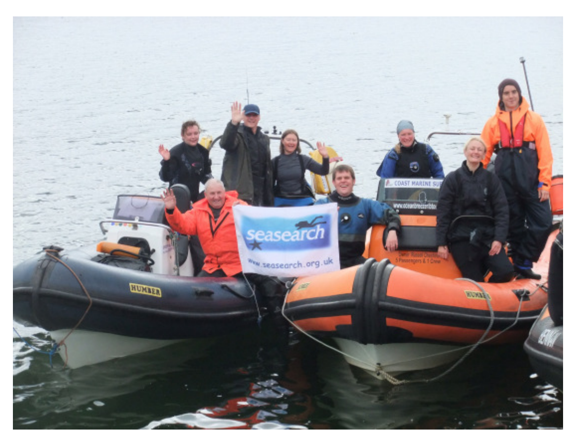
Seasearch divers departing to survey South Arran pMPA (SC)