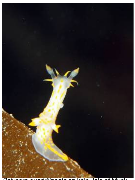
Polycera quadrilineata on kelp, Isle of Muck (DW)

Maxwell Bank, south of Isle of Eigg, has a fairly level seabed scattered with large boulders, sheltering a well developed bed of live maerl in between. Scallops ( P.maximus ), squat lobsters ( M.rugosa ) and occasional edible crabs (C.pagurus) were recorded on the maerl. It is speculated that the large boulders protected the maerl bed from damaging activities such as scallop dredging. Further south at Elizabeth rock off Ardnamurchan (near which was surveyed on 17 June: see 1.1), the kelp forest on top of the rock was full of fish like ballan wrasse Labrus bergylta with many A.digitatum growing on stipes which, as observed west of Elizabeth rock. However, the sheer vertical wall was carpeted in Antedon bifida featherstars.