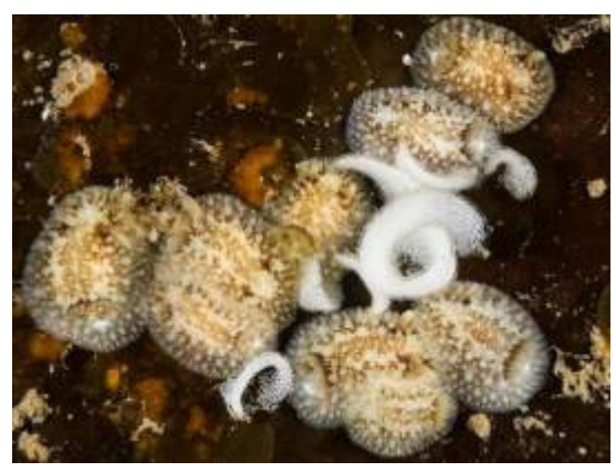
Several Onchidoris bilamellata nudibranchs at Skelly pinnacle, St Abbs Head