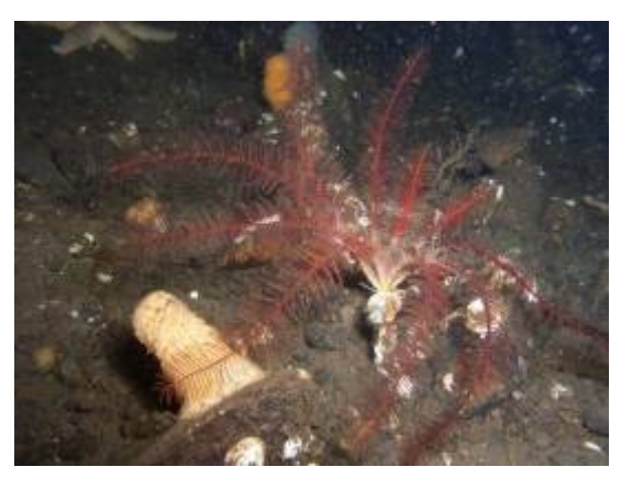
Feathertars ( A.bifida ) on horsemussels ( M.modiolus ) near Finnart, Loch Long (CD)

Following a Seasearch Observation course run by Calum Duncan for 19 participants held over two midweek evenings at Deep Blue Scuba, Edinburgh, Seasearch dives were organised at Finnart terminal, Loch Long the following Sunday. Most course participants attended the diving in Loch Long, completing two qualifying forms each, and six of these were subsequently submitted. The A-frames and E-frames were covered in typical sea loch life (such as Ascidiella aspersa and Sabella pavonina) and the seabed here and at the neighbouring 'anemone gardens' site had occasional